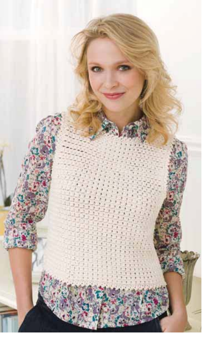
LC2533 Love to Layer Tank