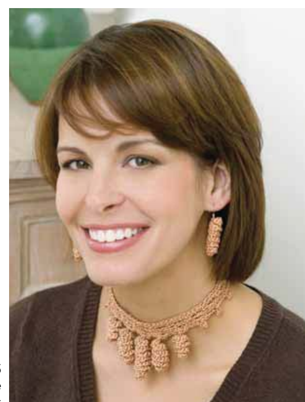
LC2225 Curlique Necklace & Earrings