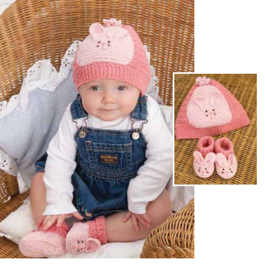
LC2432 Bunny Hat & Booties

Aunt Lydia's Bamboo Crochet Thread is luxurious and soft — making it perfect for apparel, baby items and accessories. Made of 100% viscose from bamboo with a recyclable core and label, it is the "natural" choice for projects.