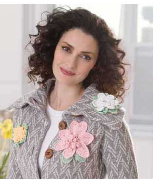
LC2534 Bodacious Flowers