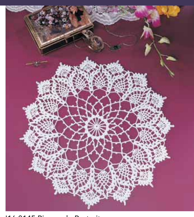
J16.0145 Pineapple Portrait

South Maid® has been America's favorite brand of crochet thread for more than 50 years. Made of 100% pure mercerized cotton in a wide range of colorfast shades, South Maid® products are available in a bedspread weight thread, suitable for a variety of crochet and craft projects.