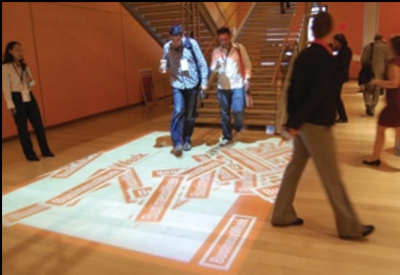
EyeStep - turns open floor spaces into an ongoing experience of movement, action, fun and excitement

EyeClick Ltd. specializes in creating inventive products that transform designated spaces into magical experiences. The company's EyeStep™, EyeWall™, EyePlay™, and EyeTouch™ products open up a world of possibilities to engage audiences in out-of-home locations. EyeClick has helped leading brands, from Samsung and Volvo to NASA and GE, transform their floors, walls and window areas into spectacular interactive displays that leave a long-lasting impression on visitors. EyeClick gives designers, architects, retailers, media companies and other organizations the ability create rich interactive digital content in public spaces, including lobbies, medical centers, restaurants, museums, airports and retail stores.