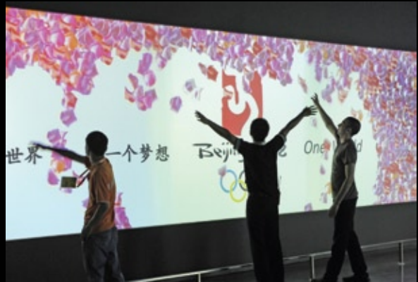
EyeWall - a unique interactive surface where graphics and content are affected by movement