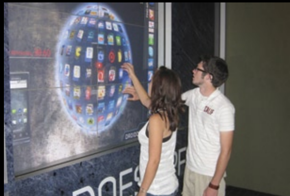
EyeTouch - transforms any glass, window or LCD display into a touch activated surface