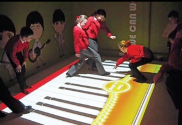
EyePlay - a virtual playground with motion activated games that everyone can play with their entire body