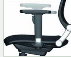
Armrest height adjustment