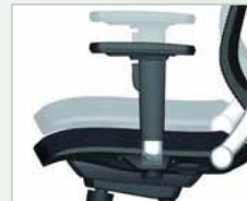
Seat height adjustment