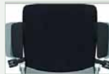
Armrest width adjustment