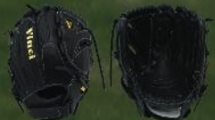
TC21-VM - 12" SOLID WEB MESH BACK W/VELCRO STRAP