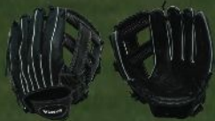
BRV1951 - 11.5" TOMBO WEB OPEN BACK