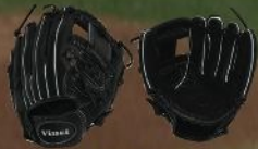
BRV1957 - 10.5" I-WEB OPEN BACK