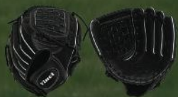
BRV1953 - 11" CLOSED BASKET WEB OPEN BACK