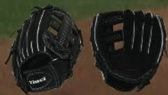
BRV1961 - 10" SINGLE POST WEB OPEN BACK