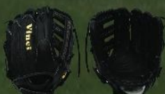
RCV-VM - 12.5" TRIPLE TOMBO WEB MESH BACK W/VELCRO STRAP