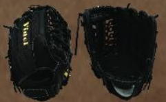
AB74-VM - 13" NET-T WEB MESH BACK W/VELCRO STRAP