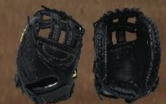
JCV-VM - 33" Catcher DUAL POST H - WEB MESH BACK W/VELCRO STRAP