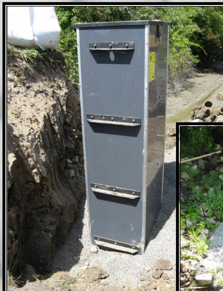
Control Structure Installations & Repairs ~ (see reverse for related anti-seep applications)

Once any void spaces are identified and all loose or permeable soils are removed around a failing structure, AquaBlok can be added as a simple backfill. No soil blending or mechanical compaction is necessary (reducing labor and installation costs). Because the product both swells and self-compacts, AquaBlok will naturally “key” into the soil around it – providing a tight seal.