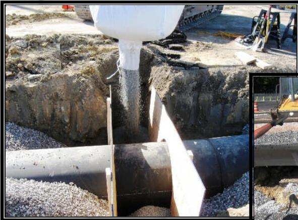
Trench Dam Installations ~ (for sewers and other utilities)

The unique physical attributes of AquaBlok – both in its dry and in its hydrated form – have proven to make it a highly versatile material for an equally diverse array of geotechnical applications. The base product's composition is simple: powdered sodium bentonite wrapped around a crushed stone core. But the variations – in the balance of clay and stone, particle size, and even treatment additives – allow for use in many settings and for many distinct purposes. The product is highly durable in that it “heals” if disturbed, withstands repeated freeze/thaw cycles, resists erosional forces, and re-hydrates an infinite number of times if exposed to prolonged periods of draught.