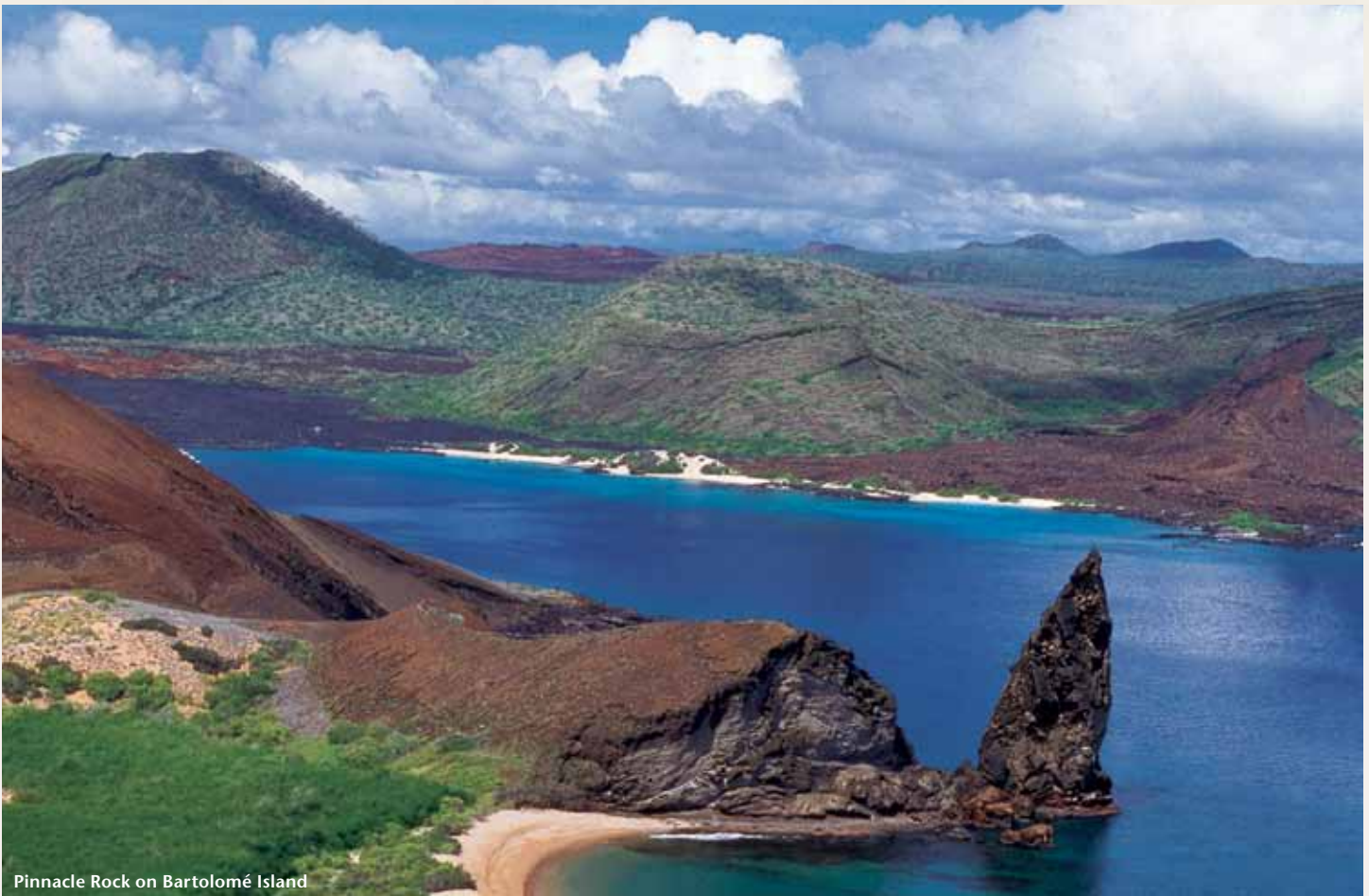
Pinnacle Rock on Bartolomé Island