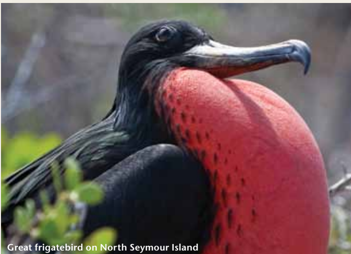
Great frigatebird on North Seymour Island