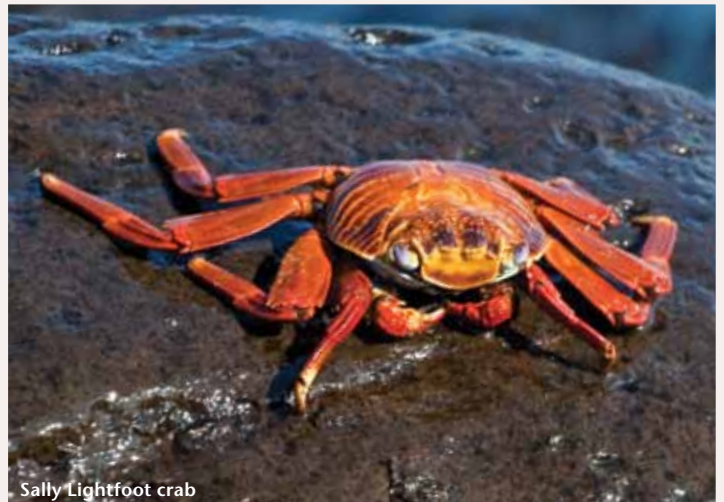
Sally Lightfoot crab