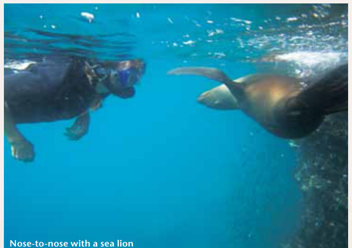
Nose-to-nose with a sea lion