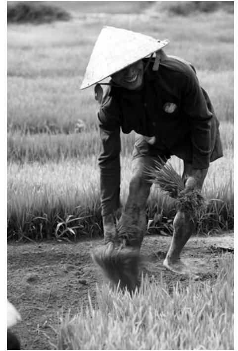
Traditionally, rice paddies here are "wide enough for a flock of storks to spread their wings."

the Museum of Vietnamese History each have a unique story to be told. You'll also stroll along Lê Công Kiều, a street known for its treasure trove of antiques. Dinner is included tonight.