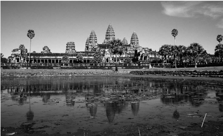
Your tour begins with an exploration of the enormous Angkor Wat.