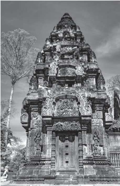
Discover the masterpieces of ancient sculptors at Banteay Srei.