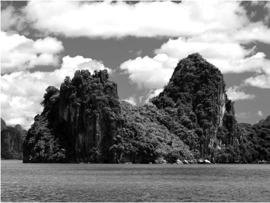
Experience nature's majesty in Ha Long Bay, Vietnam.