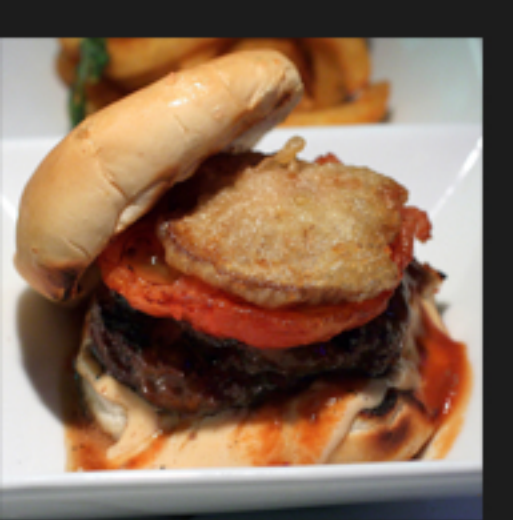
a suckerpunch of beef flavor

the kobe burgers will blow you away -menupages