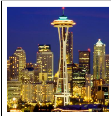
SEE YOU in Seattle!

For more information, visit <a href="www.SourcePointTraining.com">www.SourcePointTraining.com</a>, email admin@sourcepointtraining.com or call 800-217-5660 x103 .