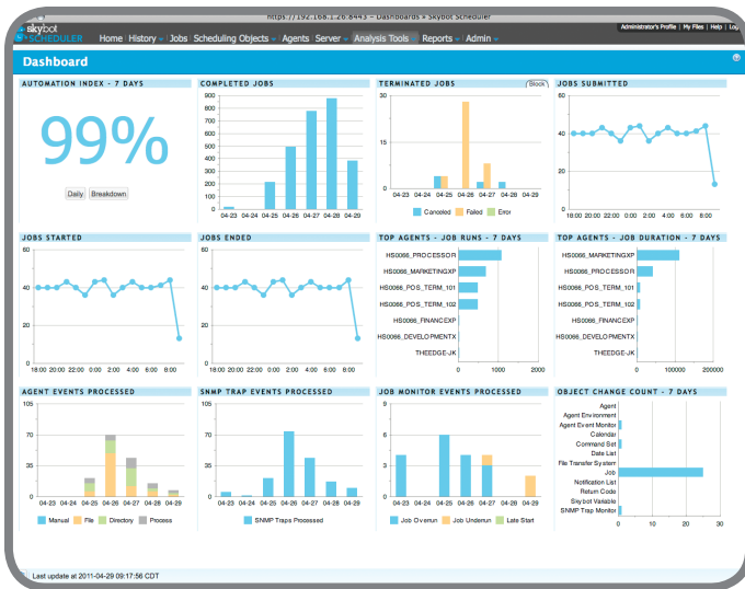
▲ The Skybot Scheduler Dashboard helps you identify recent trends in your enterprise schedule.

dency processing. Just tell Skybot Scheduler how you want the batch job to run and it does the work. You don't need to bother anyone in the middle of the night because jobs run out of order.