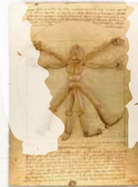
Inspiration: " Vitruvian Man " by Leonardo da Vinci c. 1487 | Pen and ink with wash over metalpoint on paper