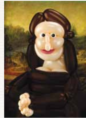
Inspiration: " Mona Lisa " by Leonardo da Vinci c. 1503-1506 | oil on poplar