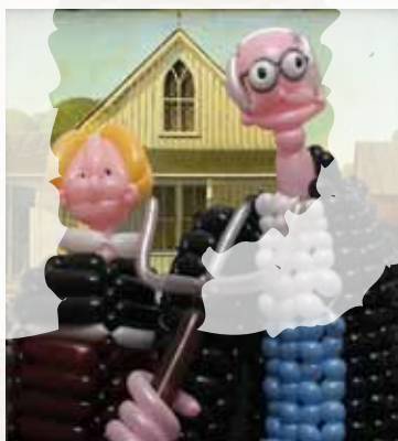
Inspiration “ American Gothic ” by Grant Wood 1930 | oil on beaverboard