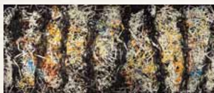
Inspiration: “ Blue Poles: Number 11, 1952 ” by Jackson Pollock 1952 | oil on canvas