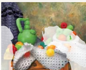
Inspiration: “ Still Life, Drapery, Pitcher, and Fruit Bowl ” by Paul Cézanne 1893-1894 | oil on canvas