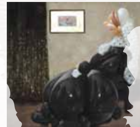
Inspiration: " Arrangement in Grey and Black: The Artist's Mother " by James McNeill Whistler 1871 | oil on canvas