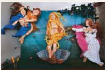
Inspiration: “ The Birth of Venus ” by Sandro Botticelli c. 1486 | tempera on canvas