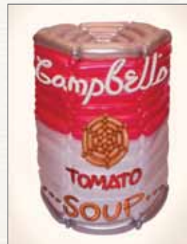
Inspiration: " Campbell's Soup Can " by Andy Warhol 1962 | Synthetic polymer paint on canvas