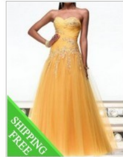
A-Line Strapless Sweet-Heart Applique Beading Pleated Tulle Sku:Eveningdresses1138 US$464.82 US$230.91