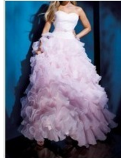
Ball Gown Strapless Romantic Finge Pink Brooch Ruffles Sku:Eveningdresses1406 US$378.76 US$189.38