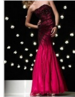
A-Line/Princess Line Dress Strapless Package Hip Fuchsia Sku:Eveningdresses1405 US$578.12 US$289.06