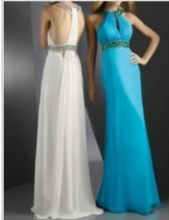
Empire Halter.Backless Blue Rhinestones Beading Sequins Sku:Eveningdresses1448 US$396.46 US$198.23

Women in all ages like to show off themselves in various evening dresses at different parties. But do you find the right one? What kind of evening dress is flattering your body shape perfectly? Which evening gown will fit and flatters you best? The following guidelines may be helpful when choosing your evening dress.