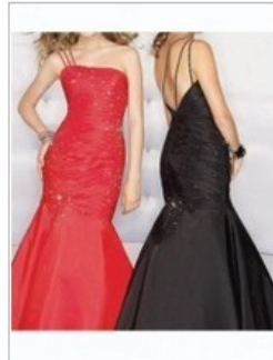
Mermaid Soft Red Package Hip Taffeta Pleated Beading Floor Sku:Eveningdresses1175 US$374.98 US$187.49