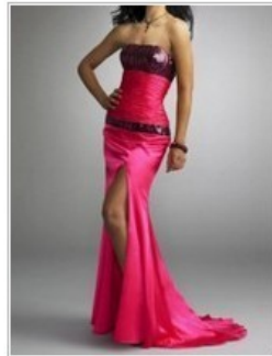
Ruby Red Mermaid/Trumpet Strapless Chest Wrap Pleated Sku:Eveningdresses1176 US$376.97 US$188.48