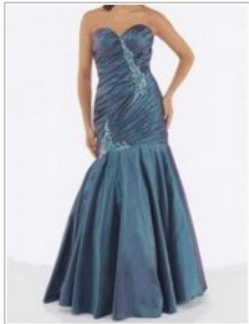
Trumpet Sweet-Heart Package Hip Applique Pleated Taffeta Sku:Eveningdresses1178 US$376.97 US$188.48

Fabrics: Satin, chiffon, tulle Neckline: Strapless Silhouette: A-line empire dress