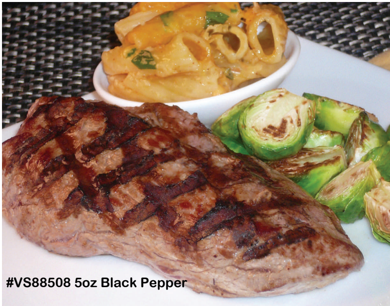
#VS88508 5oz Black Pepper