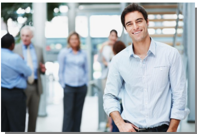
24X7 Hosted Technical Support