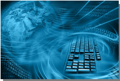
Continuous Compliance Validation