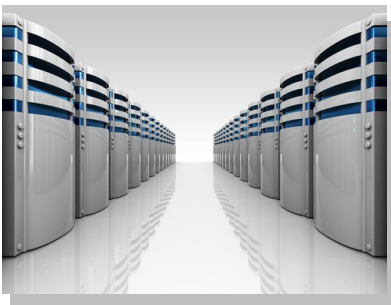
SSAE16 Certified, Secure Hosting