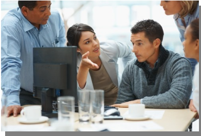
30+ Years Industry Experience