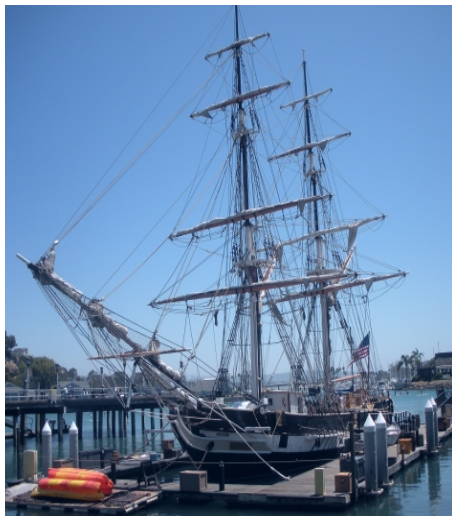
The Pilgrim located at the Dana Point Harbor near the Ocean Institute by the Headlands.