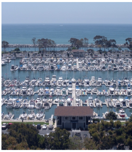
The Dana Point Harbor, a modern Marina on the Pacific Coast.