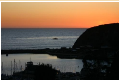
Sunset on the Headlands.