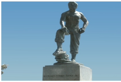
Richard Henry Dana.