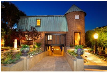
The upper house, a French Normandy.