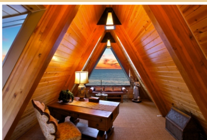
A-frame Home Captain's Quarters.