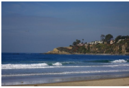
The Dana Point Headlands.