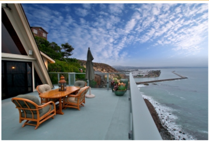
Resort living with breathtaking views of Dana Point Harbor.