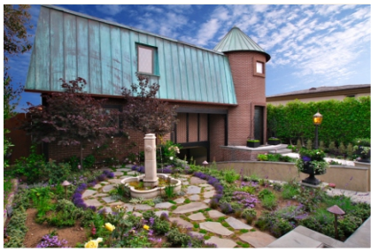
Charming English gardens.