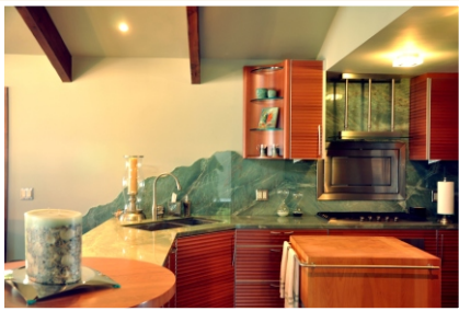
Quartzite counters and custom cliff backsplash.