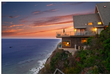
Lower house, a coastal view of the A-frame home.