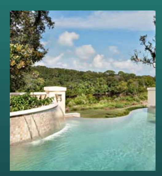
AMELIA ISLAND, FL November 3rd at 2pm