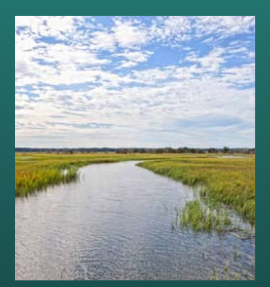
SEA ISLAND, GA November 1st at 3pm