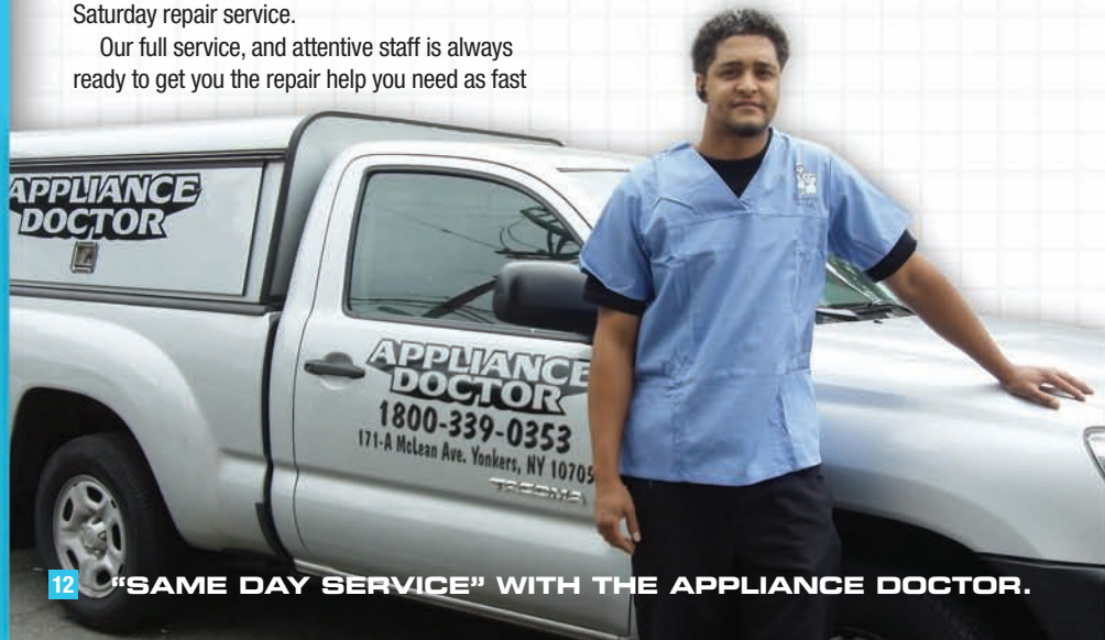
12 "SAME DAY SERVICE" WITH THE APPLIANCE DOCTOR.

We invest heavily in continuing training for all Appliance Doctor service technicians.