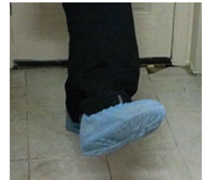
"SAME DAY SERVICE" WITH THE APPLIANCE DOCTOR. 13

All of our technicians also cover their shoes with sanitary paper booties before stepping foot in your home.