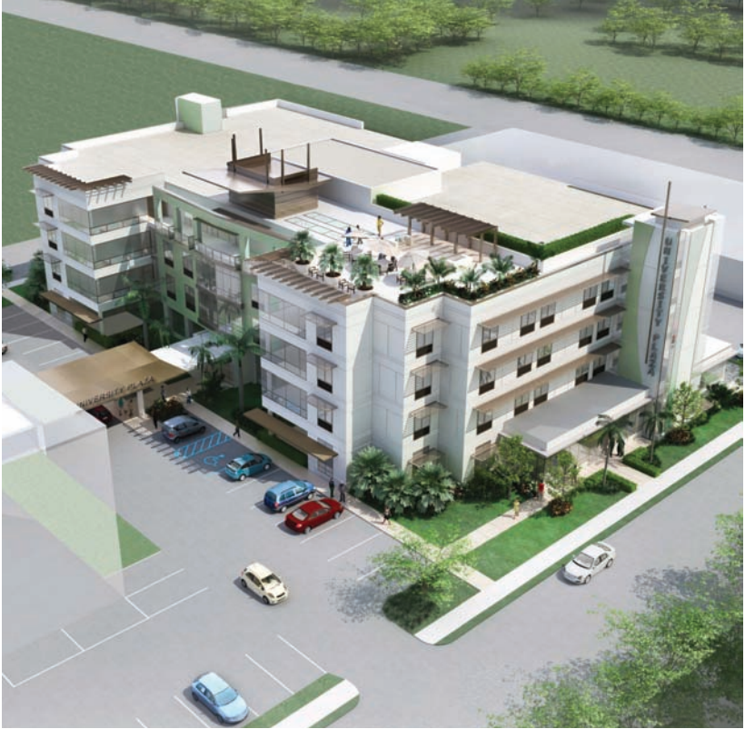
Rendering of University Plaza Rehabilitation & Nursing Center