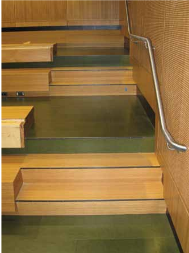
Emerald Buffalo University Student Lounge Oregon