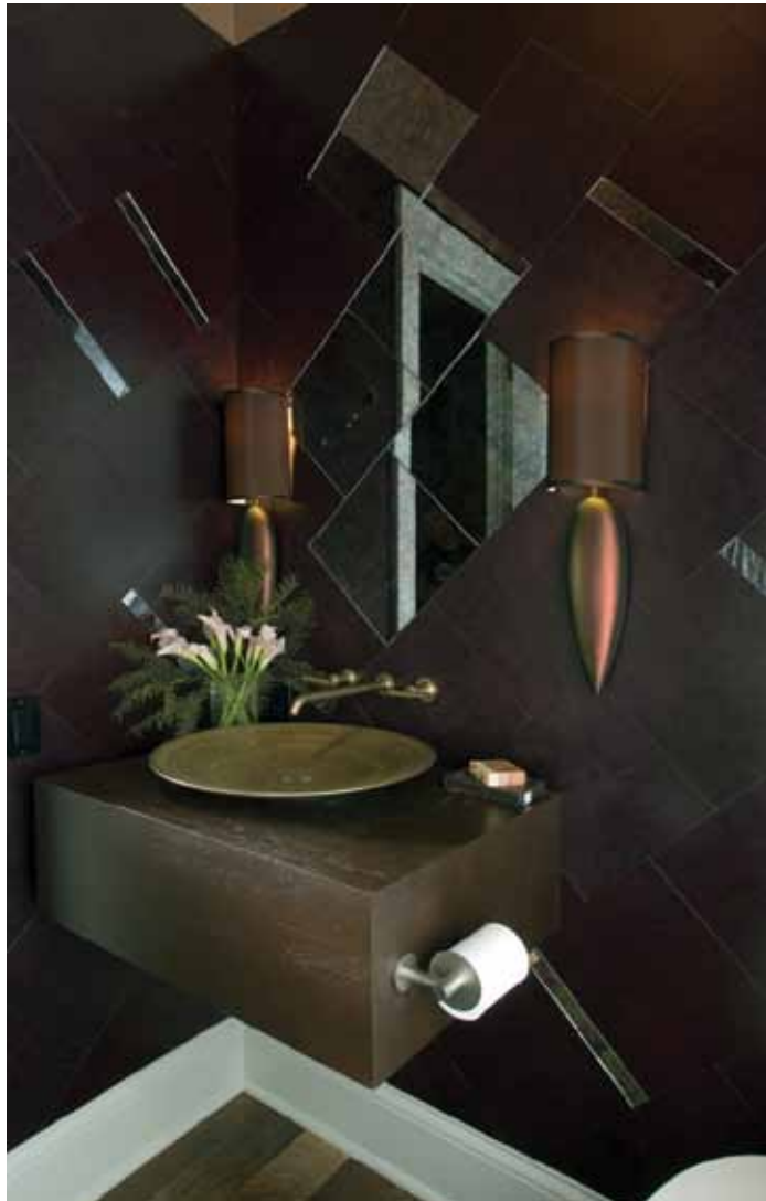
Burgundy Buffalo and Mirrors Echelon Collection Private Residence Chicago, Illinois Featured in Cooking Light Magazine