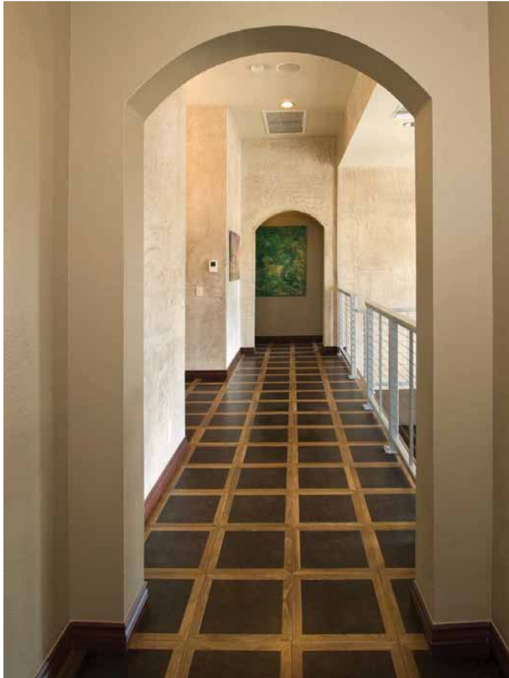
Mahogany Leather & Maple Lancaster Collection Parquet Floor Nevada