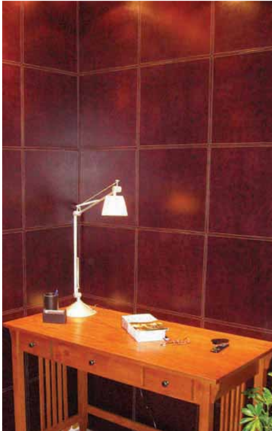
Burgundy Buffalo — Amish Top Stitch Echelon Collection