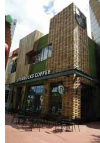
Antique Custom Application Echelon Collection Sheet Size Starbucks, Disney Paris, France