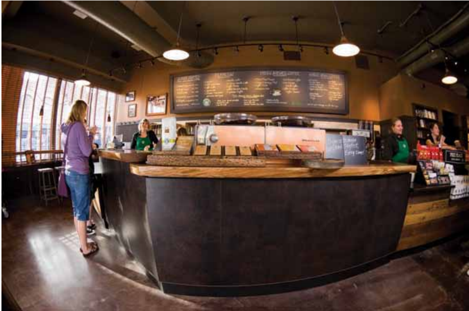
Antique Custom Sheet Application Echelon Collection LEED® certified store Washington State