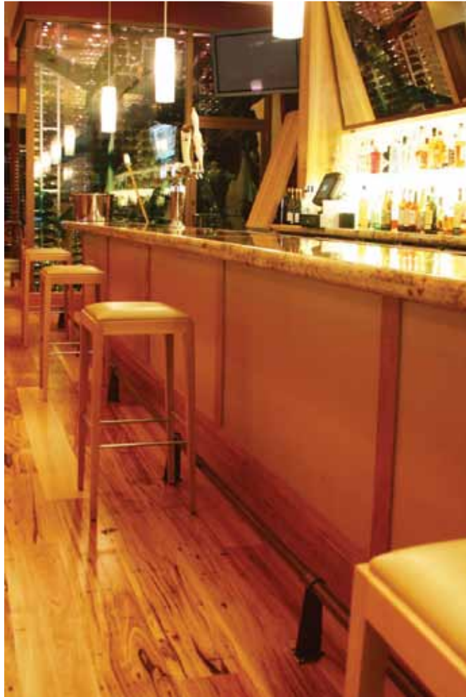
Pearl White Sheet Size Echelon Collection Restaurant Washington, DC