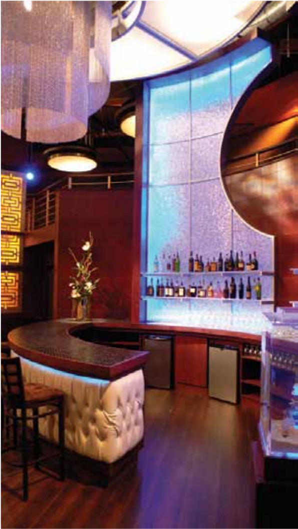
Chestnut Buffalo — Amish Top Stitch Echelon Collection Hell's Kitchen TV Set Los Angeles, CA