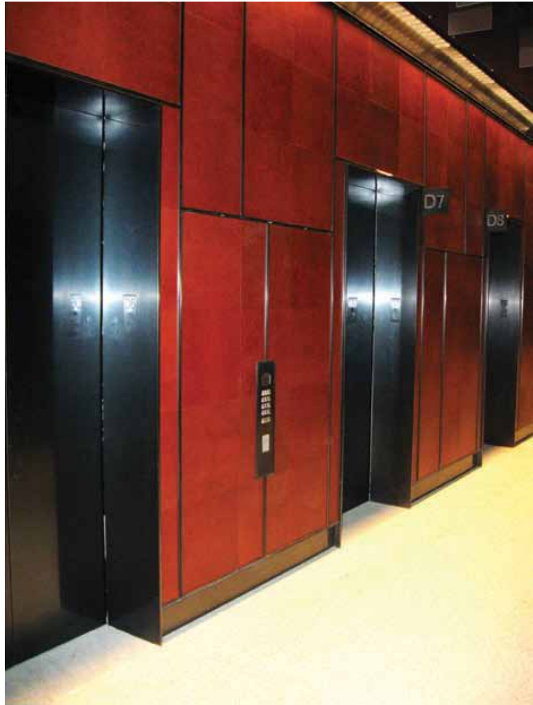
Bobby Brown Milano Collection Elevator Lobby Bryant Park, Manhattan LEED® Platinum Project