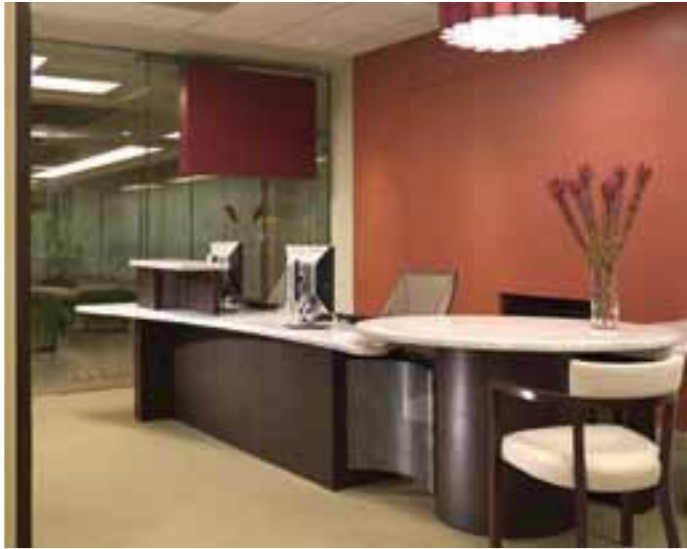
Mahogany Recycled Leather Echelon Collection Medical Office California