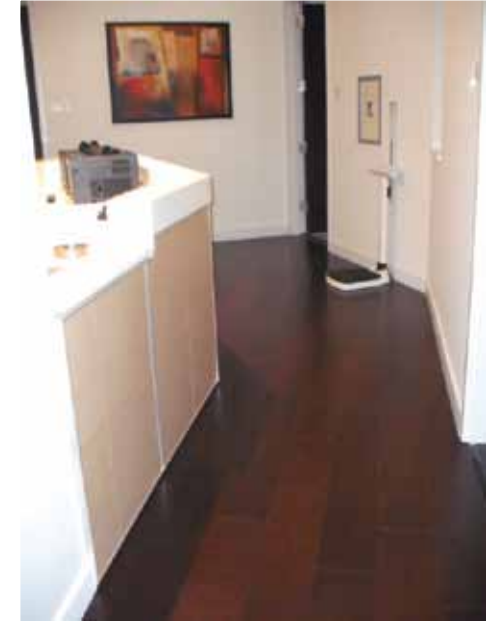
Desk: Pearl White & Stitch Echelon Collection Floor: Cariboo Auburn Rainforest Collection Medical Clinic