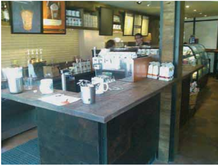
Distressed Leather Echelon Collection Coffee Shop Budapest, Hungary