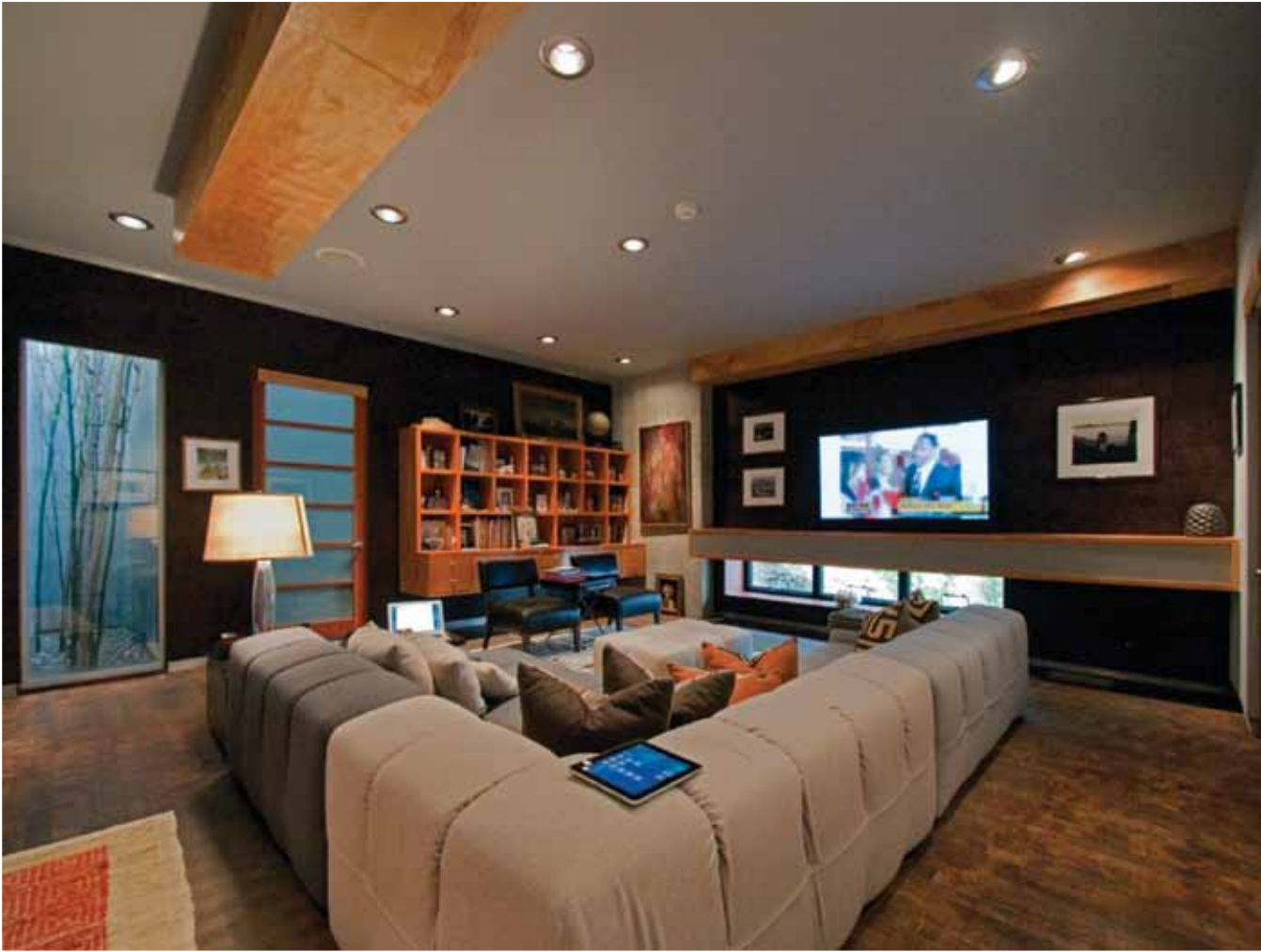
Mahogany Buffalo Media Room California