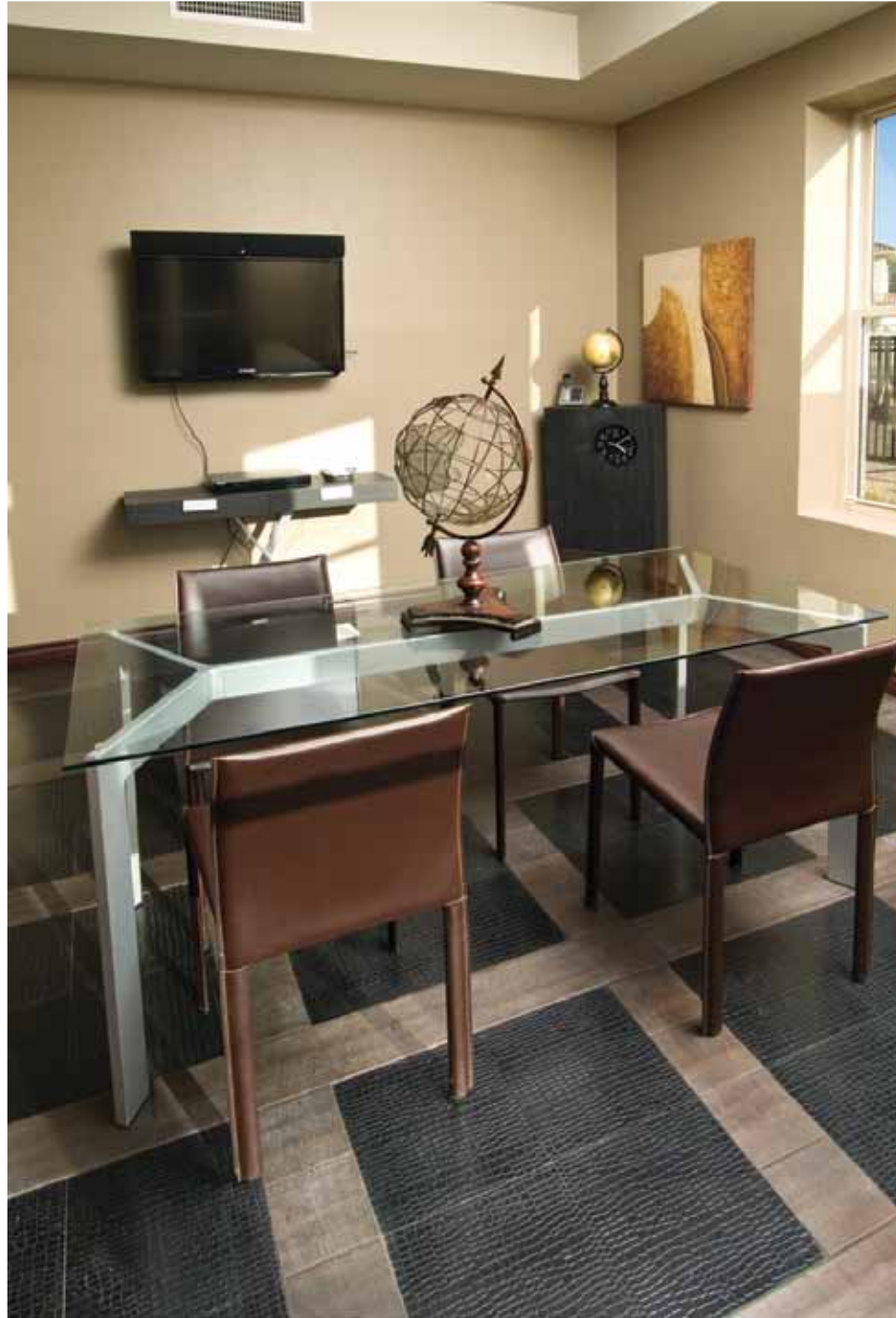
Ebony Crocodile mixed with Bamboo Echelon Collection Home Office Las Vegas, NV