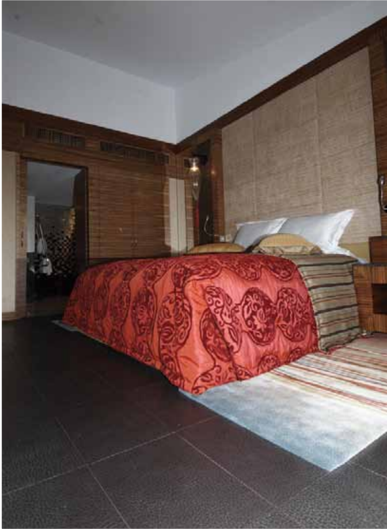
At the Opening