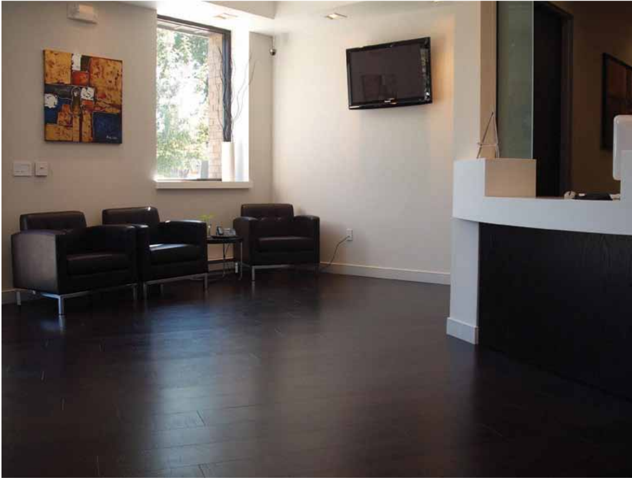
Grizzly Sable Rainforest Collection Medical Clinic Washington, DC