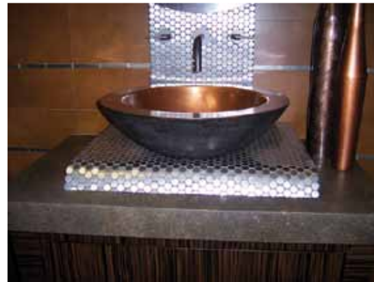
Caramel Hide Leather mixed with metal inserts Milano Collection Private Residence California