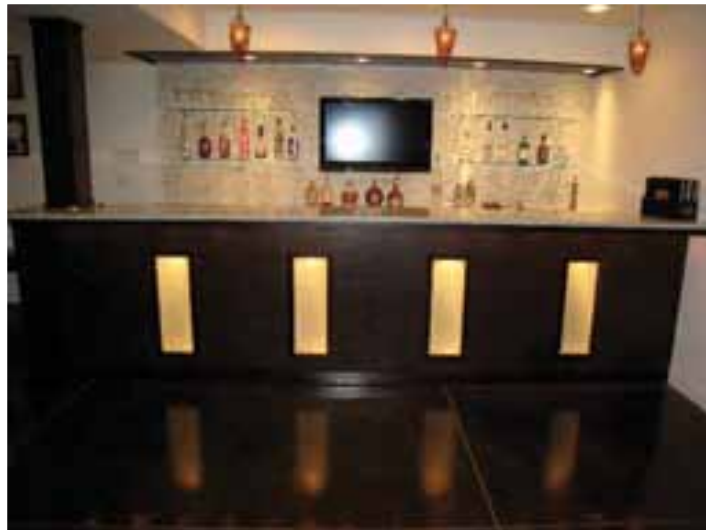
Mahogany Buffalo Echelon Collection Residential Bar