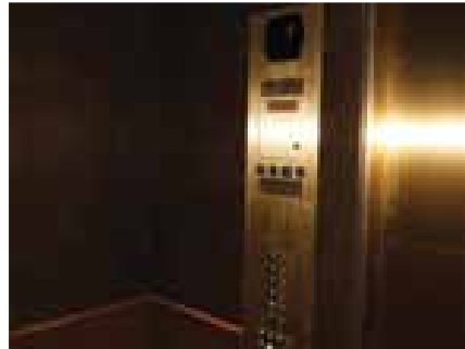
Mahogany Buffalo Echelon Collection