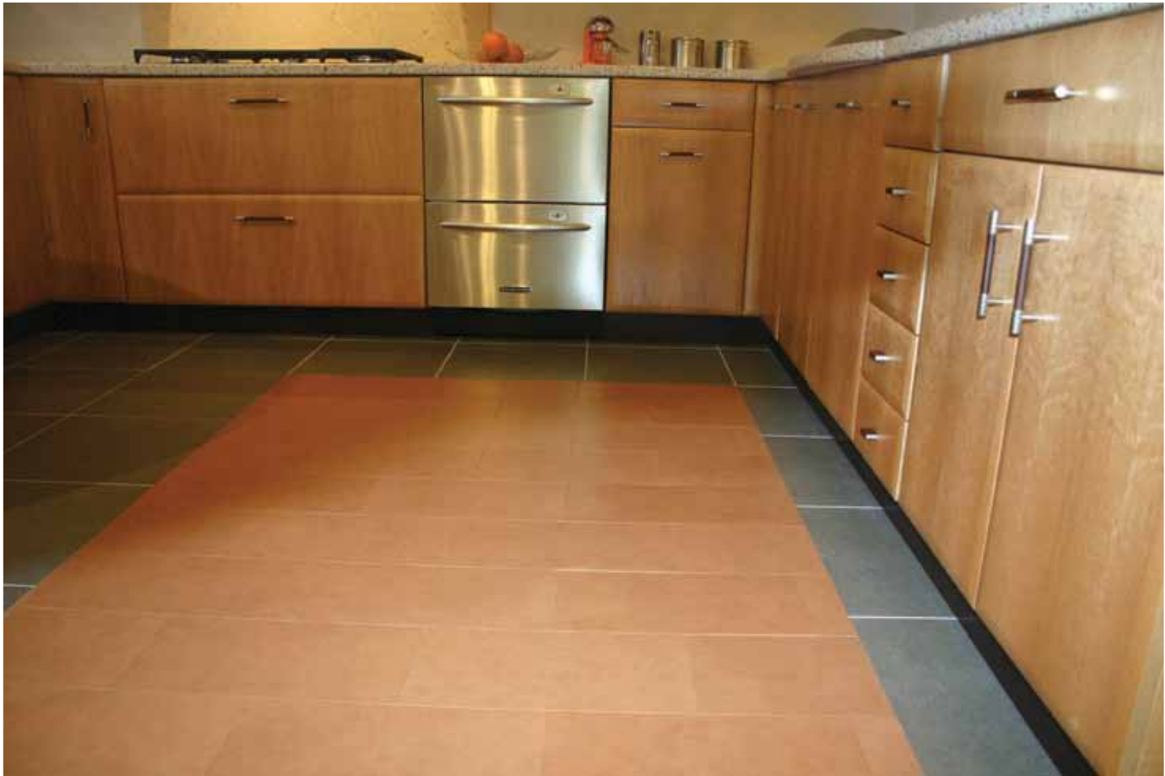
Toffee Buffalo Echelon Collection Kitchen Application Virginia