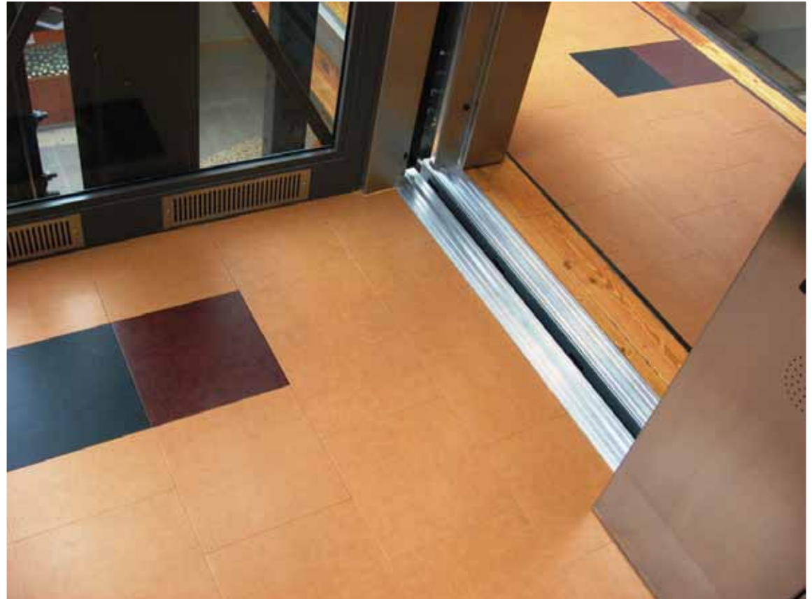
Parchment, Toffee and Chestnut Echelon Collection Office Elevator Floor Oregon