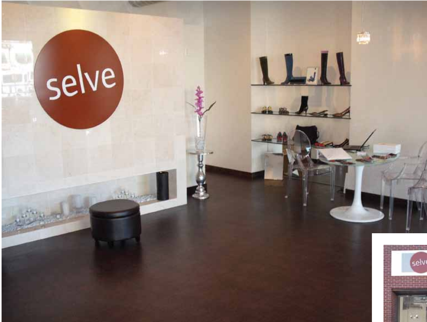
Mahogany Buffalo Echelon Collection Shoe Store Red Bank, NJ