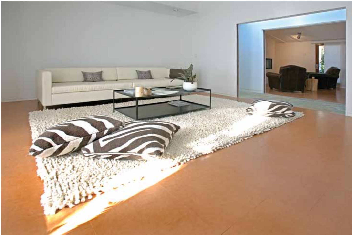
Toffee Buffalo Floor Echelon Collection Media Room Malibu, CA