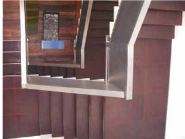
Grand Staircase with Double stitched leather Colorado