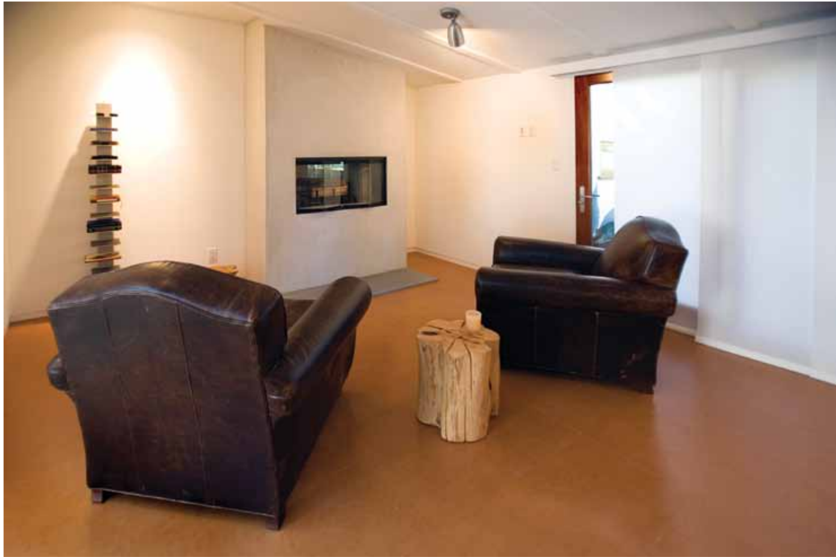
Toffee Buffalo Echelon Collection Media Room Malibu, CA