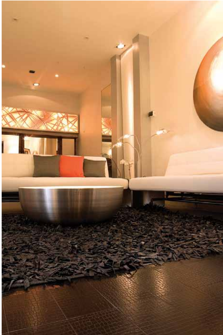
Ebony Crocodile Echelon Collection Living Room San Jose, Costa Rica