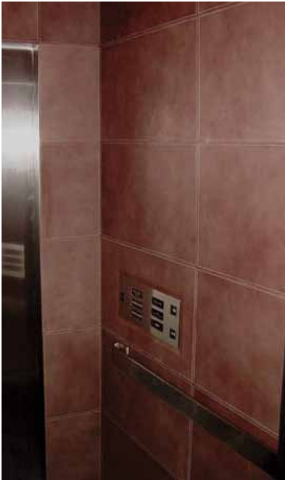
Custom Color and Top Stitch Echelon Collection Hotel Intercontinental