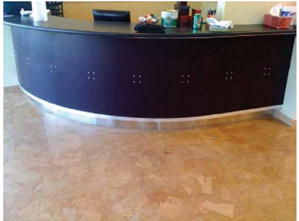
Burgundy Buffalo with Stud Accents Echelon Collection Cork Floor Classic Collection, Beauticork Church Reception Desk Wisconsin