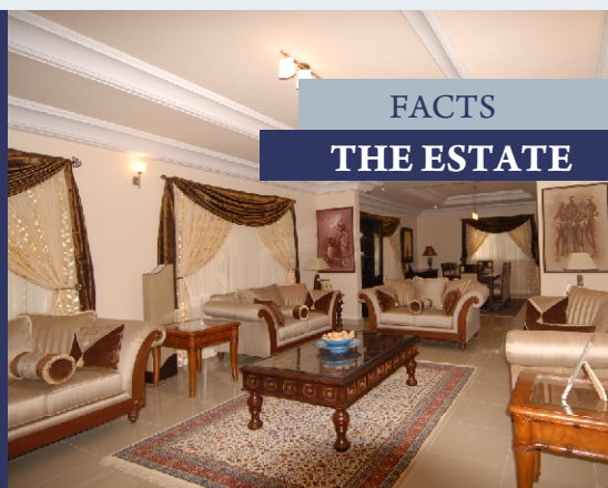
Furnishing options available on request