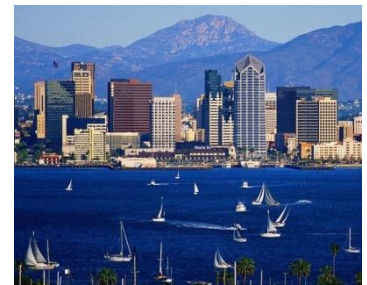
SEE YOU in San Diego!

For more information, visit www.SourcePointTraining.com , email admin@sourcepointtraining.com or call 800-217-5660 x103 .