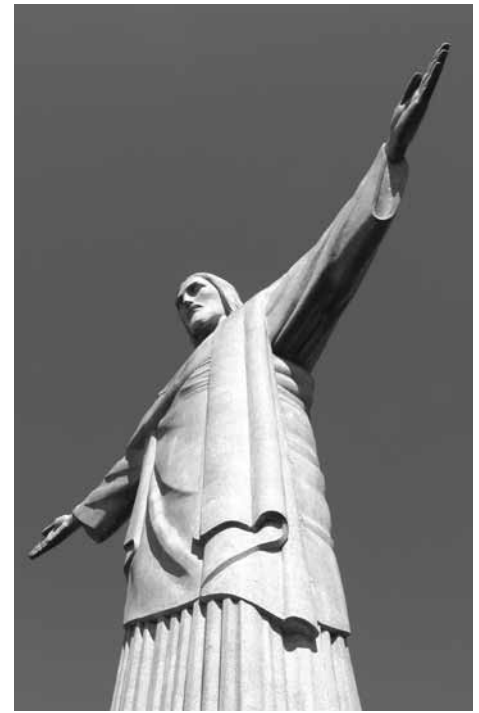
Christ the Redeemer looks over the people of Rio de Janeiro, Brazil.