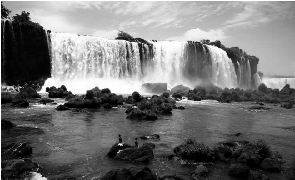
The sight of Iguassu Falls' majestic falling waters will take your breath away.