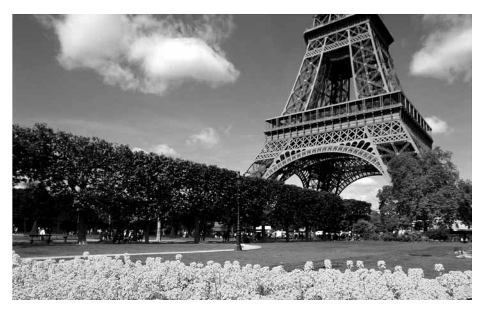
Say "bonjour!" to the Eiffel Tower during your sightseeing tour of Paris.