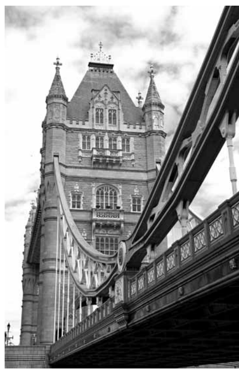
Your tour begins with a look at London's icons, including the Tower Bridge.

A motorcoach brings you to Verona this morning, where you'll embark on a guided sightseeing tour. Highlights of your tour include the Romanera Verona Arena and the Casa di Giulietta, where couples young and old pin love notes to the wall