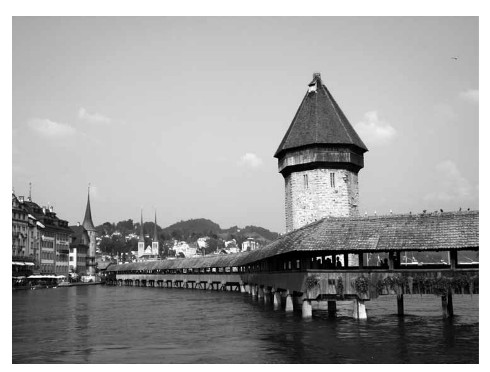
Soak in the Old World charms of Lucerne.