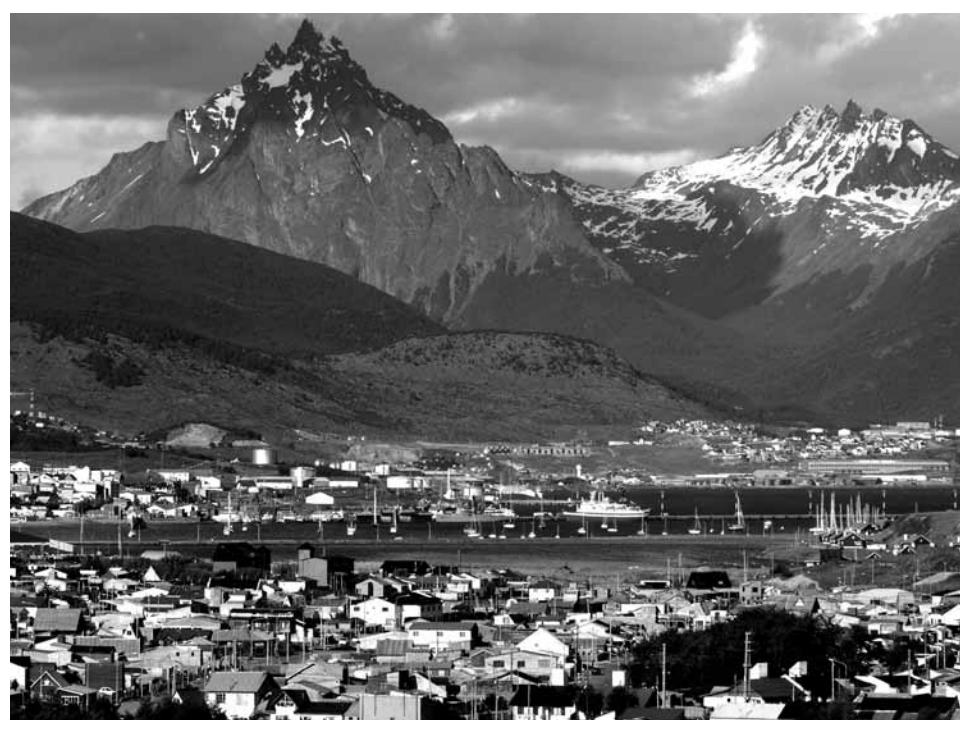
The Chilean port of Ushuaia lays claim to the title of southernmost city on Earth. Once you leave here, there's nothing but open water between you and the South Shetland Islands.

Over the next four days, you'll explore the rocky South Shetland Islands and the northernmost tip of the Antarctic continent. You'll explore the penguin rookeries on the South Shetland Islands and cruise through Neptune's Bellows into the natural harbor at Deception Island. On King George's Island, you'll encounter Adélie and Chinstrap penguins, and on Livingston Island, you'll come face-to-face with elephant seals. While you're cruising between islands, keep an eye on the sea, where you might spot orcas and humpback whales. Weather permitting, you'll cruise along the Antarctic coast in the Gerlache Strait and gaze in awe at the towering sea cliffs lining the Lemaire and Neumayer Channels. You might also make stops at Paulet Island, where geothermal energy keeps parts of the island ice free and 200,000 Adélie penguins live; the uninhabited Melchior Islands, where new geographic discoveries are still happening thanks to the islands' thick covering of ice; the Gentoo penguin rookery and the towering icebergs of Cuverville Island; Portal Point, where blue ice and towering sea cliffs greeted the first explorers to venture onto the Antarctic Plateau; calving icebergs at Neko Harbor; Pleneau Island,