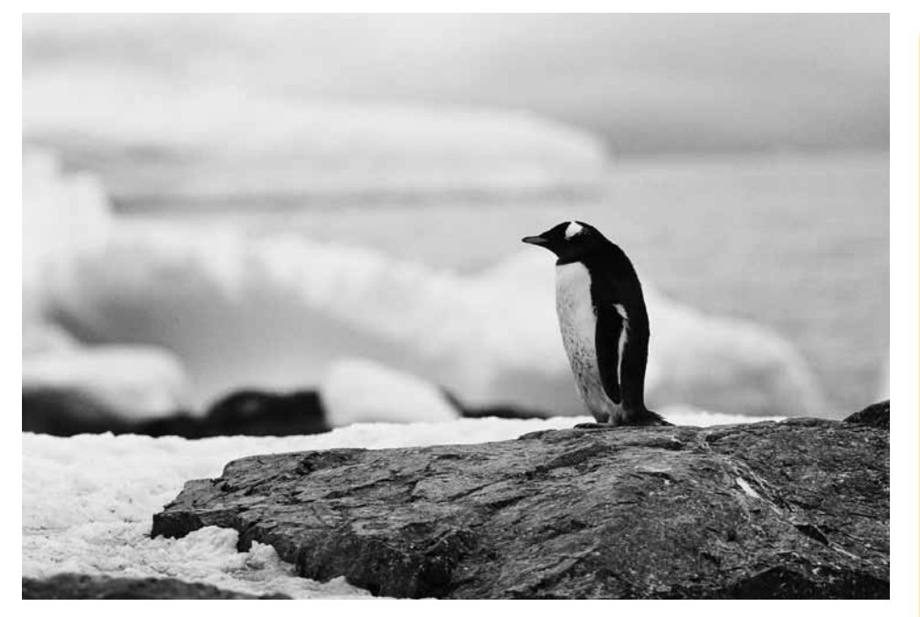
With a white, bonnet-like strip running across their heads, Gentoo penguins are easy to recognize.