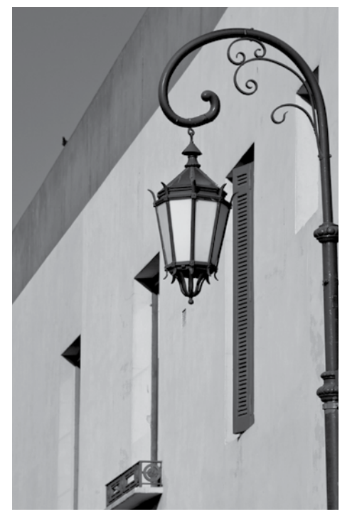
Get a feel for Porteños' daily life in La Boca, Buenos Aires' renowned artists' quarter.

or barbecue, lunch, followed by a folklore show before returning to the city. Included meals: breakfast