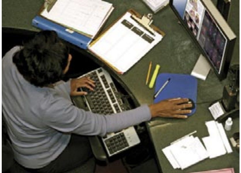
Digital asset management (DAM) software allows for easy cataloging and indexing of large quantities of media files.

Software that is used to manage a library of media assets is called