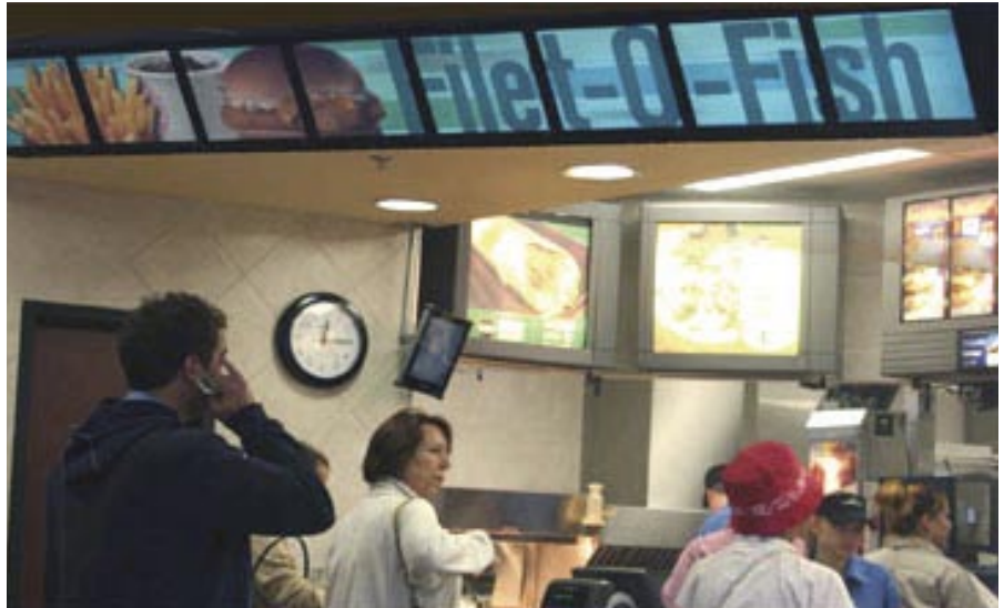
A newly rebuilt McDonald's in Chicago incorporates content-managed digital signs. Eight 15-inch LCD flat screens set side-to-side show synchronized marketing content

"We already have the toolkit built," Malec