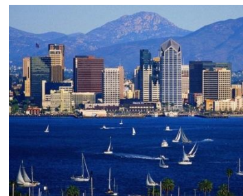
SEE YOU in San Diego!

email admin@sourcepointtraining.com or call 800-217-5660 x103 .