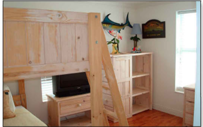
Bedroom No. 3