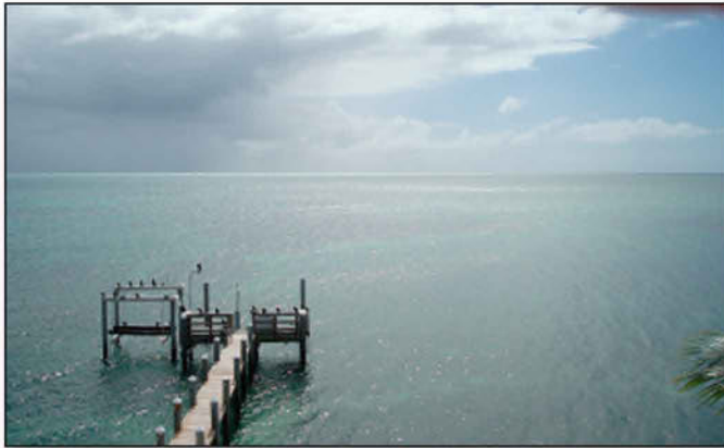
View From Master Bedroom