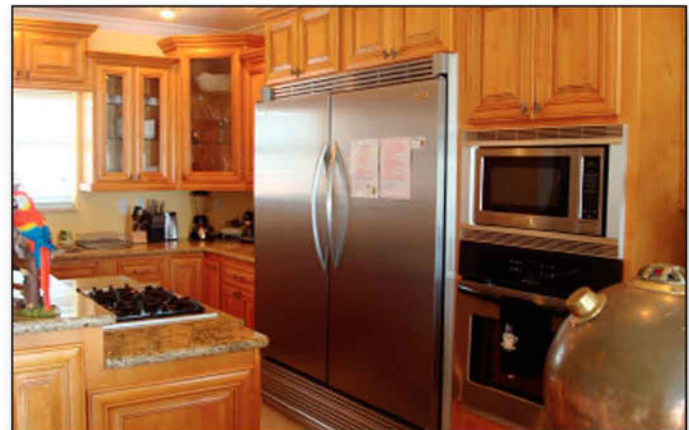
Double Sized Refrigerator/Freezer