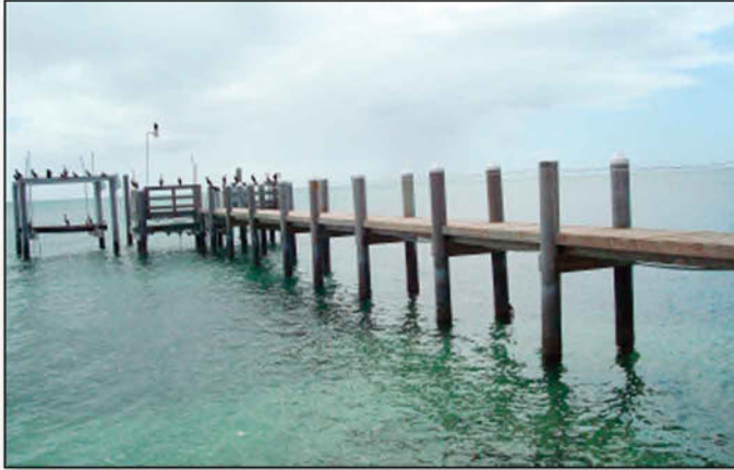
Private Dock with Boat Lift