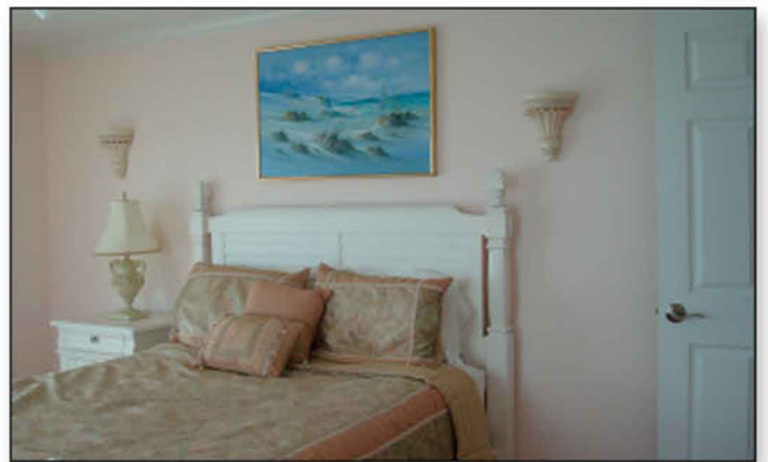
Bedroom No. 2

For Additional Information go to: www.auctionforce.com/conchkey