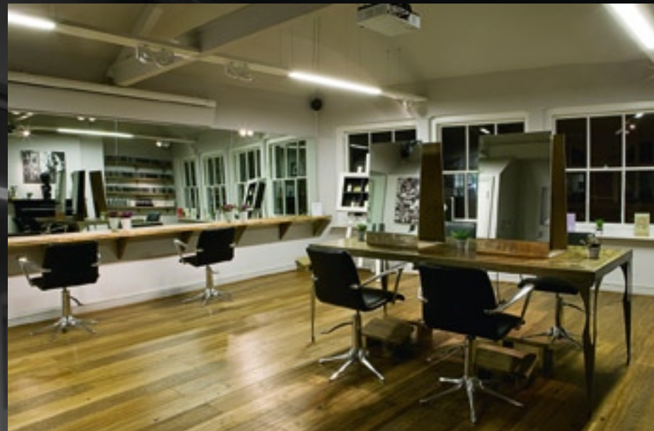
ALLILION ACADEMY LONDON