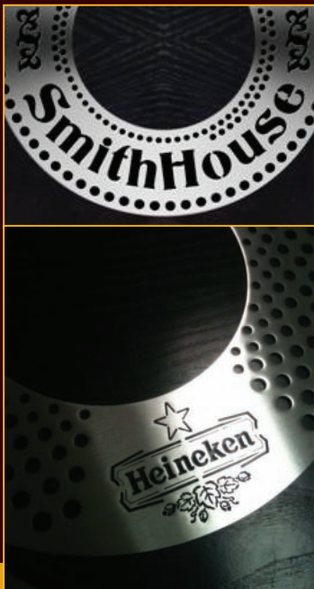
Table Tops Design, Materials, etc.

Laser Cut Drip Trays with your logo or branding