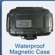
Waterproof Magnetic Case