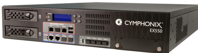
Network Composer EX550

Cymphonix Internet Management solutions help organizations ensure, enable and maximize their investment in their Internet circuits. In turn, using Cymphonix solutions, organizations can improve the performance and reliability of mission-critical traffic while eliminating the risk of inefficiency or failure due to non-critical traffic.