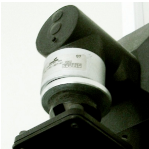
Magnetic Release Mechanism