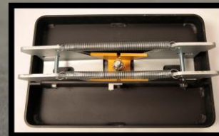
Bottom View of Lid in Locked Position – Pick Holes Blocked