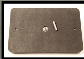
Top of Lid with a Secure Keyed Bryce Fastener™ & Pick Holes