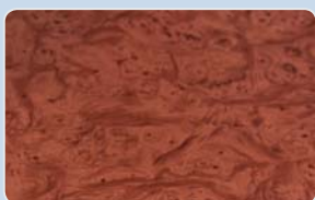
Burl Wood Acrylic