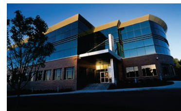
Corporate Headquarters, Omaha