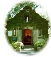
Mission Nombre de Dios