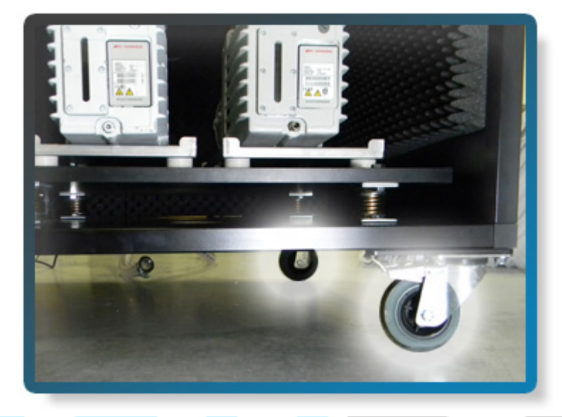
Fully movable bench

Fully movable bench with a weight capacity above 440 kg / 970 lbs and Chemical resistant worksurface for laboratory applications. Different bench sizes available depending the configuration of the LC/GC/MS. Black steel powder coated frame.