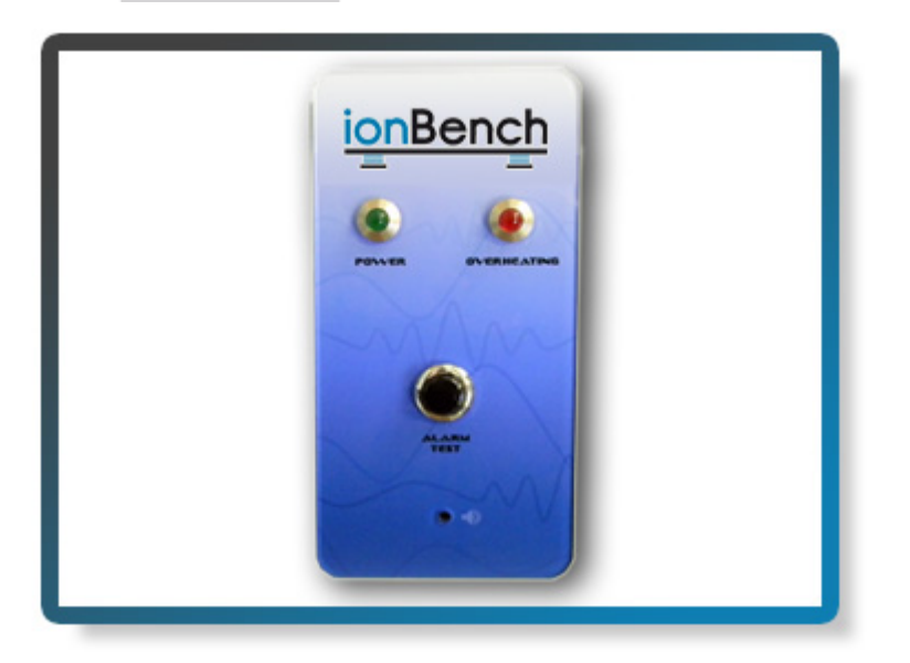
Overheating temperature alarm

In case of air intake or air exhaust obstruction, the air inside the noise enclosure could exceed the limits set by vacuum pump manufacturers for the pump operation at best capacity.