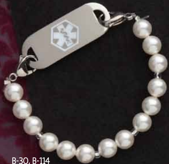
B-30, B-114 White Pearl *Pictured with T-25 White Tag B-30 - Size 7.5" B-114 - Size 6.5"