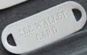
T-17 Engraved with See Wallet Card