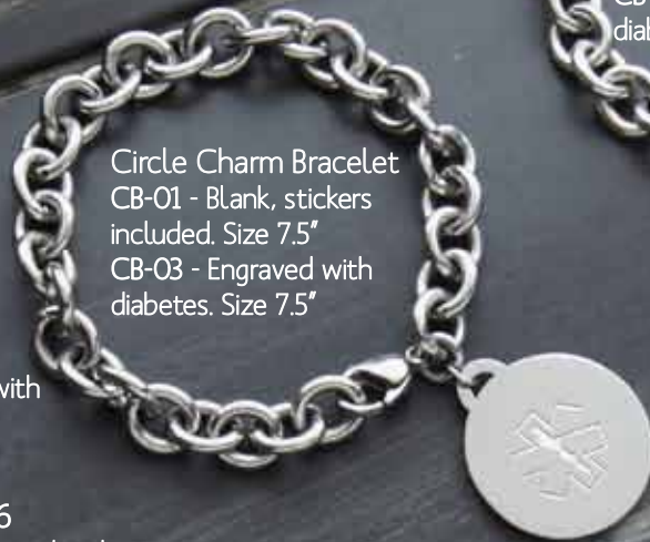
Circle Charm Bracelet CB-01 - Blank, stickers included. Size 7.5" CB-03 - Engraved with diabetes. Size 7.5"