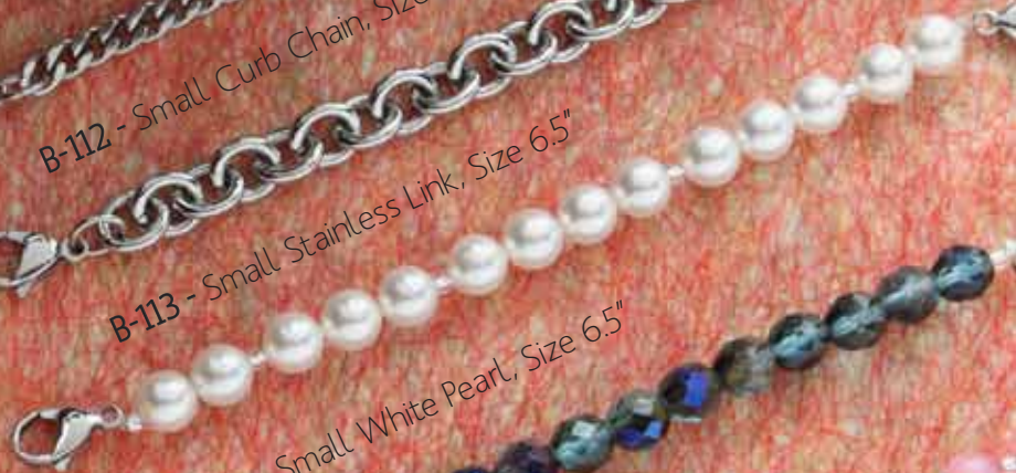
B-114 - Small White Pearl, Size 6.5"