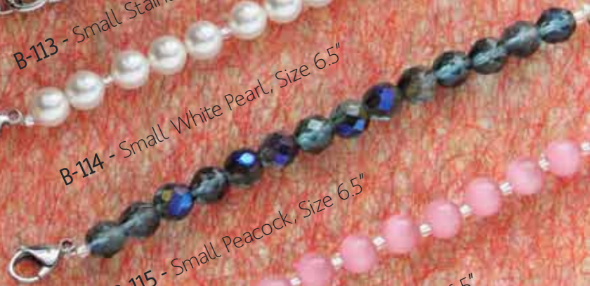
B-115 - Small Peacock, Size 6.5"