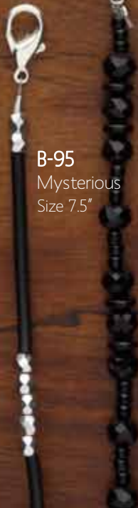
B-95 Mysterious Size 7.5"