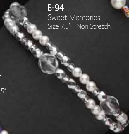
B-94 Sweet Memories Size 7.5" - Non Stretch