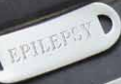
T-34 Engraved with Epilepsy