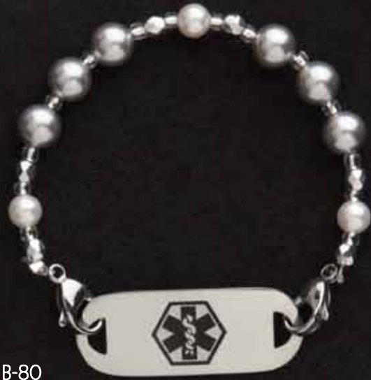
B-80 Silver Ice Size 7.5" *Pictured with T-28 Black Tag