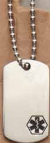
ADT-05 Black Mini Dog Tag Necklace Blank, Includes Stickers 24" Ball Chain