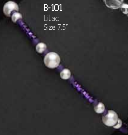
B-101 Lilac Size 7.5"