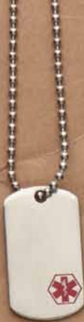
ADT-04 Red Mini Dog Tag Necklace Blank, Includes Stickers 24" Ball Chain