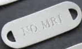
T-35 Engraved with No MRI