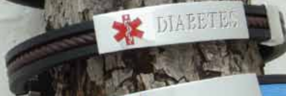
SS-05 Engraved with Diabetes Black/Brown Twist Size: 8.5"