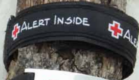
AV-02 Black Adjustable Wristband Adjustable Size: 7-8.5"