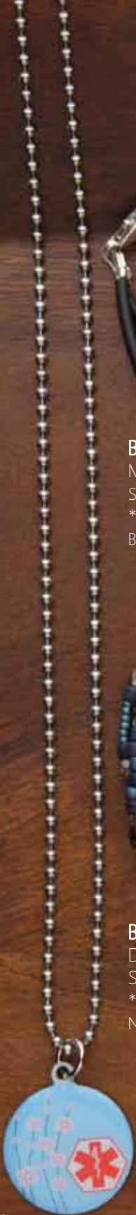
AP-03 Light Blue Pendant Blank, Stickers Included 24" Ball Chain