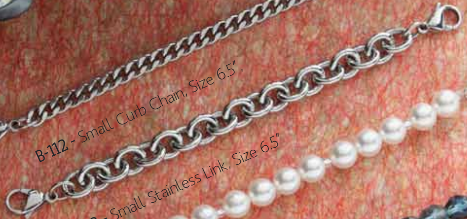
B-113 - Small Stainless Link, Size 6.5"