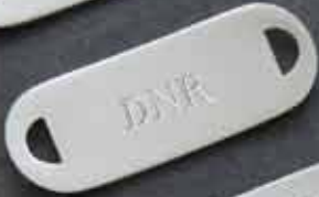
T-36 Engraved with DNR