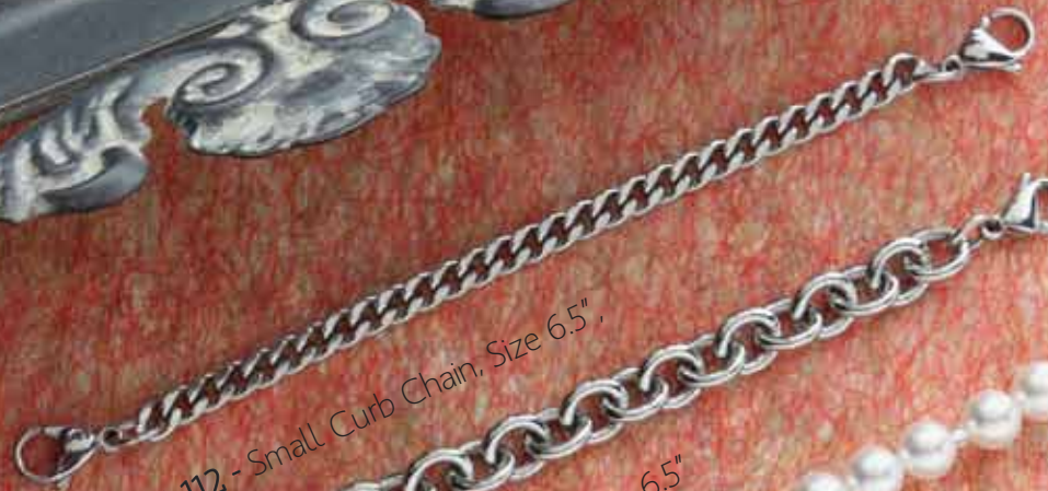
B-112 - Small Curb Chain, Size 6.5"