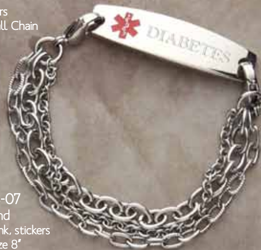
SS-06, SS-07 Triple Strand SS-06 - Blank, stickers included. Size 8" SS-07 - Engraved with Diabetes. Size 8"