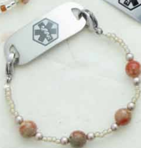
B-99 Pebble Creek Size 7.5" *Pictured with T-29 Charcoal Tag