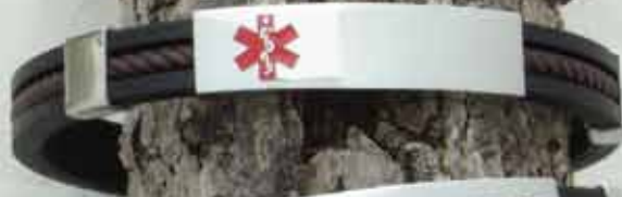
SS-03 Blank, Stickers Included Black/Brown Twist Size: 8.5"