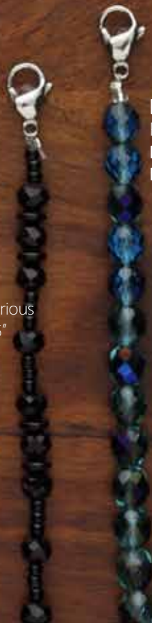
B-57, B-115 Peacock B-57 - Size 7.5" B-115 - Size 6.5"