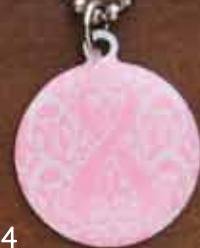
AP-04 Breast Cancer Awareness Blank, Stickers Included 24" Ball Chain