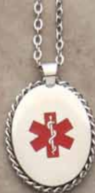
AP-07 Oval Pendant Blank, Includes Stickers 24" Ornate Chain