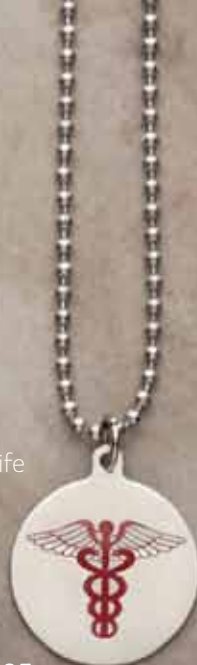
AP-05 Red Staff of Life Blank, Includes Stickers 24" Ball Chain