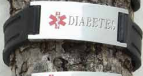
ASB-08 Engraved with Diabetes Black Silicone Adjustable Size: 6.75"-8.75"