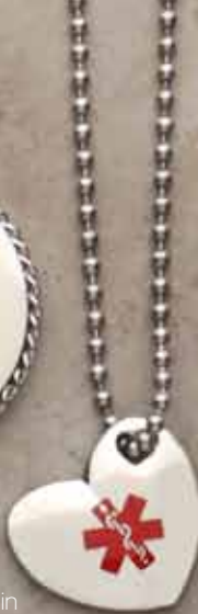
AP-02 Heart Pendant Blank, Includes Stickers 24" Ball Chain