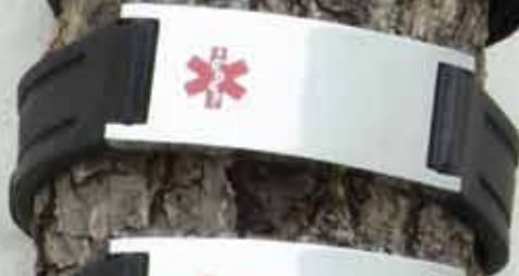
ASB-07 Blank, Stickers Included Black Silicone Adjustable Size: 6.75"-8.75"