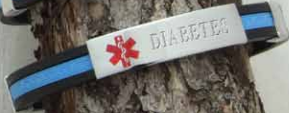
SS-09 Engraved with Diabetes Black/Blue Stainless Size: 8.5"