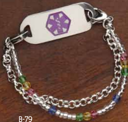
B-79 Spring Tulips Size 7.5" - Non Stretch *Pictured with T-27 Purple Tag