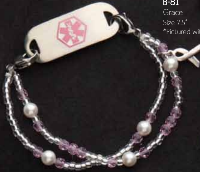
B-81 Grace Size 7.5" *Pictured with T-24 Pink Tag