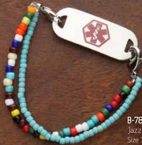
B-78 Jazz Size 7.5" *Pictured with T-11 Blank Tag