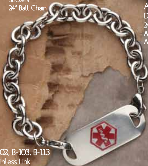
B-102, B-103, B-113 Stainless Link B-102 - Size 7.5" B-103 - Size 8.5" B-113 - Size 6.5" *Pictured with T-11 Blank Tag