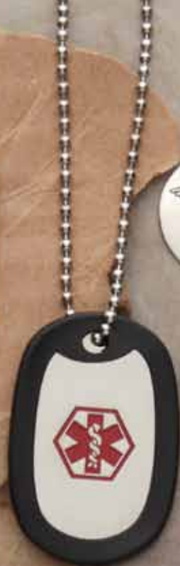
ADT-01, ADT-03 Dog Tag Necklace 24" Ball Chain ADT-01 - Engraved with Diabetes ADT-03 - Blank, stickers included