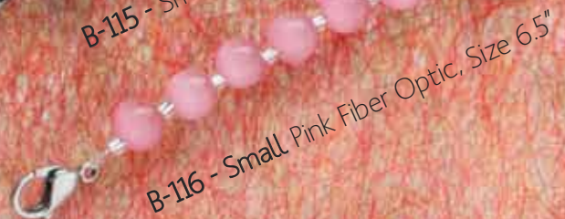
B-116 - Small Pink Fiber Optic, Size 6.5"