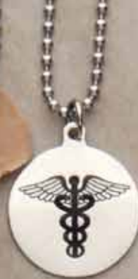
AP-06 Black Staff of Life Blank, Includes Stickers 24" Ball Chain