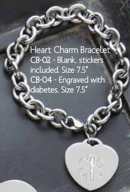
Heart Charm Bracelet CB-02 - Blank, stickers included. Size 7.5" CB-04 - Engraved with diabetes. Size 7.5"