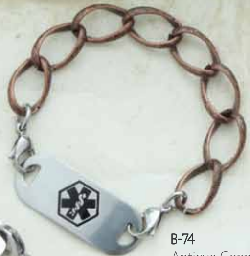
B-74 Antique Copper Size 7.5" - Non Stretch *Pictured with T-28 Black Tag