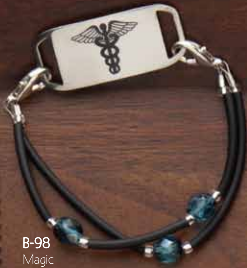
B-98 Magic Size 7.5" *Pictured with T-23 Black Staff of Life Tag