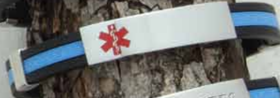
SS-08 Blank, Stickers Included Black/Blue Stainless Size: 8.5"