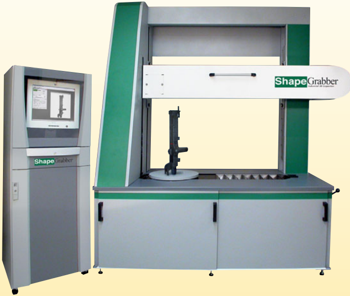
The ShapeGrabber Ai810 scanning an automotive radiator component