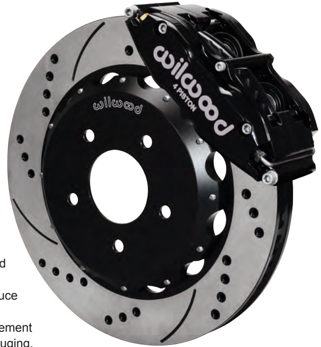
Jeep Big Brake Front Kit with SRP Drilled and Slotted Rotor ( download high-res photo ) **