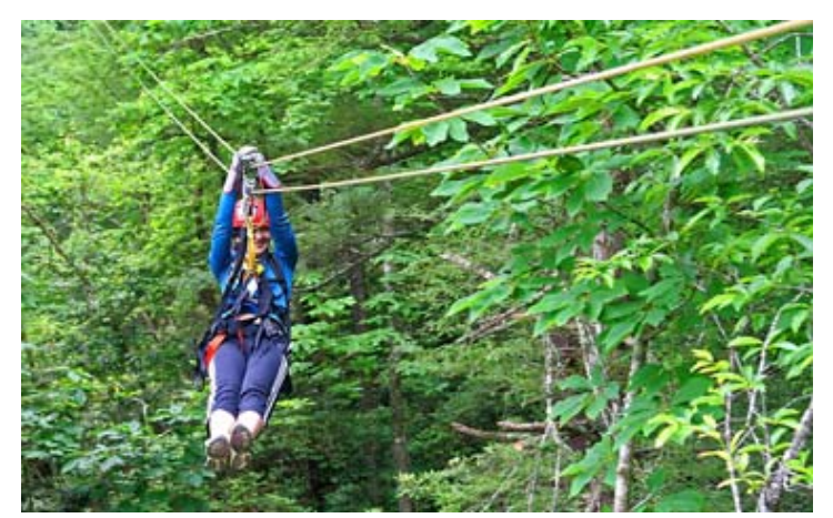
A rider enjoys a cool thrill on a West Virginia zip line.

The April issue of Travel & Leisure Magazine Online has styled West Virginia's Gravity New River Gorge Zip Lines as one of the "World's Coolest Zip Lines." The open air zip line stretches for a mile and hangs 200 feet above the ground at its highest point. Gravity New River Gorge Zip Lines are part of Adventures on the Gorge.