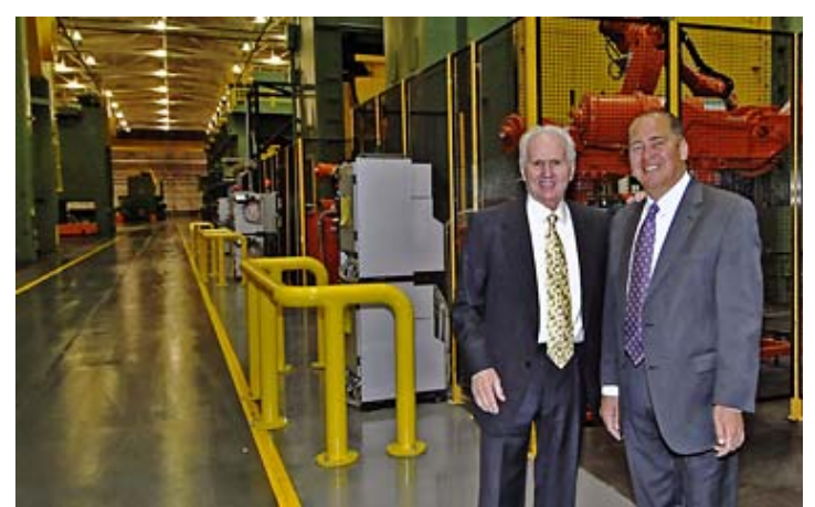
Ray Park, Chairman of the Park Corporation and Governor Earl Ray Tomblin tour the former South Charleston Stamping and Manufacturing Plant.

Gestamp West Virginia plans to invest a minimum of $100 million in the former South Charleston stamping plant and create 400 to 700 jobs. Gestamp is an international group dedicated to the design, development and manufacture of metal components and structural systems for the automotive industry. The plant will be a primary supplier for Honda and Ford. The successful effort to bring the venture to West Virginia was a collaborative effort between Gestamp, Park Corporation (owner of the stamping plant site), the city of South Charleston (Kanawha County) and the state of West Virginia. To apply, job seekers should register on the WorkForce West Virginia website workforcewv.org and enter the job titles of Production Worker and Team Assembler as their preferences.