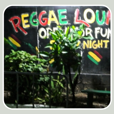
resorts, hotels, activities and tourism options in each destination are featured

AXSES creates the video and blog, also publishing both to many sites to build your social index and search results. The video can also be displayed on the brand's own website and used in many other promotional options.