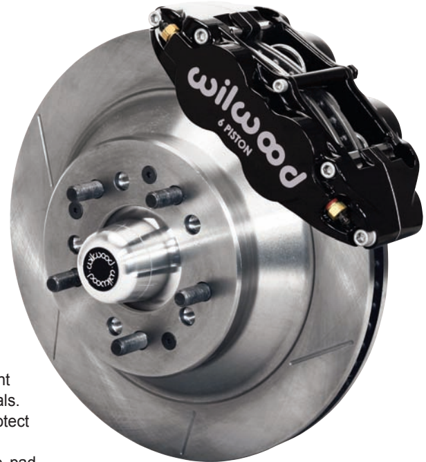
Big Brake Front Kit Assembly with GT Rotor, $1,343.99 as Shown Download High Res Photo, Click Here