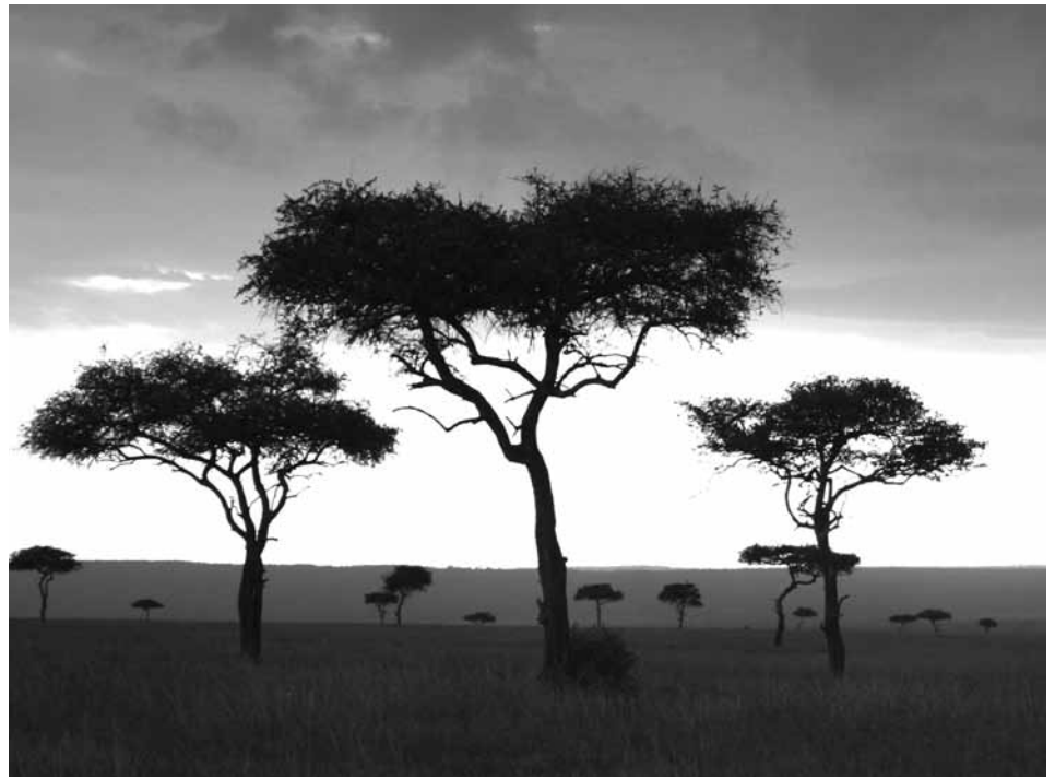
Acacia dotting the wide Serengeti plains

ley escarpment. You'll explore this verdant region on a game drive, spying the park's stunning variety of wildlife: giraffe, zebra, hippos and perhaps even the elusive tree-climbing lions. Of course, the region is well known for its alkaline namesake: beautiful Lake Manyara, home to a massive population of flamingoes—a stunning swath of pink across a shimmering lake. At your included lunch and dinner, you'll have time to rest and relax.