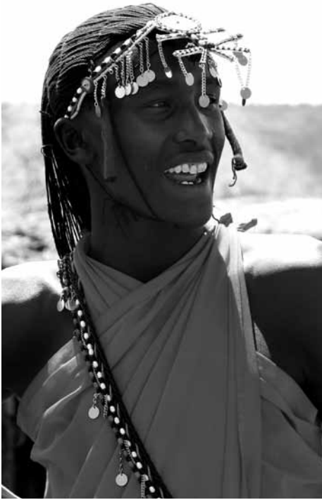
A young Masai morani, or “warrior-youth”