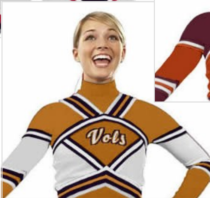
Generate lettering within images