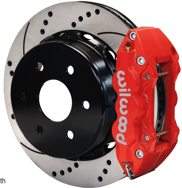
Big Brake Rear Kit with SRP Rotor and Red Caliper

Download High Resolution Photo, Click Here