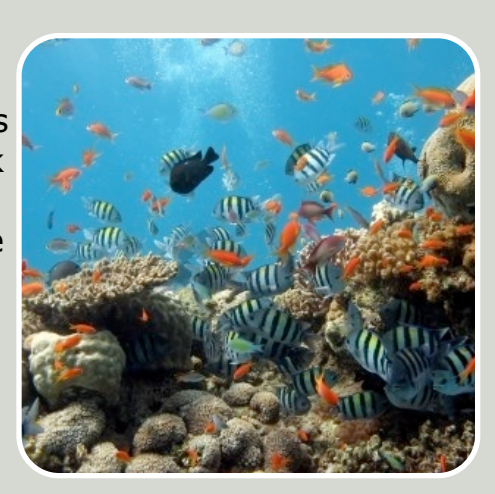
Reef fish in the red sea

You may sit quietly in a submarine or a glass bottom boat and experience the adventure of the ocean reefs.