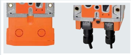
NEMA 4 (UL Type 4) IP66