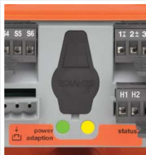
MFT interface socket with LED indicators.