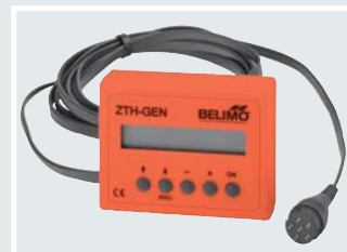
ZTH-GEN US is a handheld interface that allows field programming of running time, control signal, feedback and access to actuator error messages via the MFT interface socket. (Sold separately)