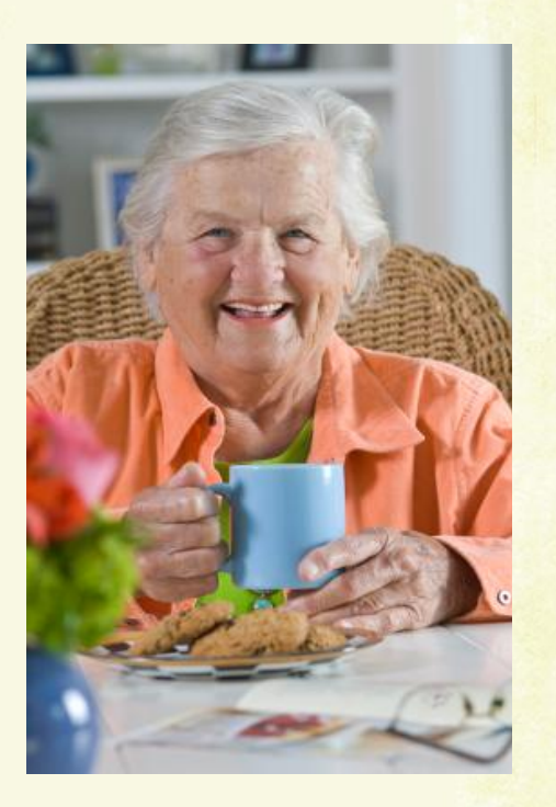
Private Rooms starting at $3,700 Semi-private rooms at $2,500

Low Cost Unique Alternative to Institutionalized Environment